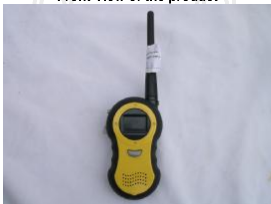
Front View of the product