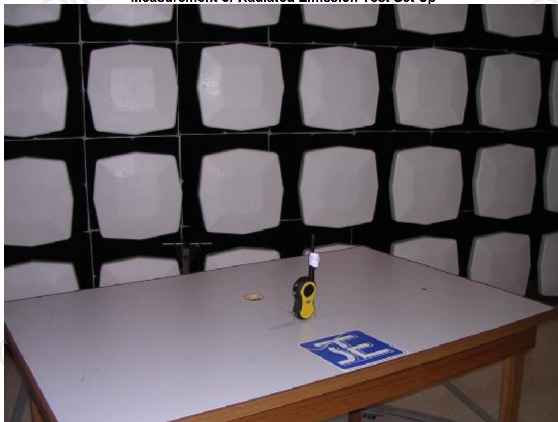
Measurement of Radiated Emission Test Set Up