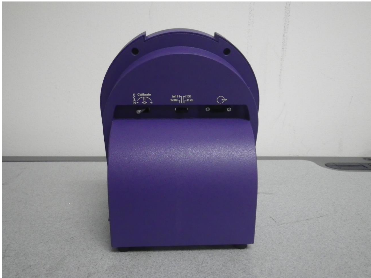
Photograph 4. Dongle, Rear