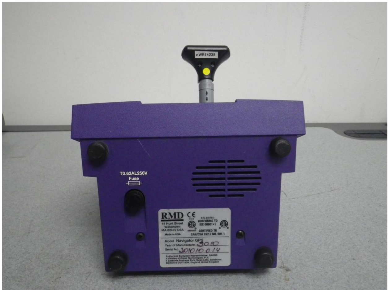
Photograph 1. Dongle, Bottom