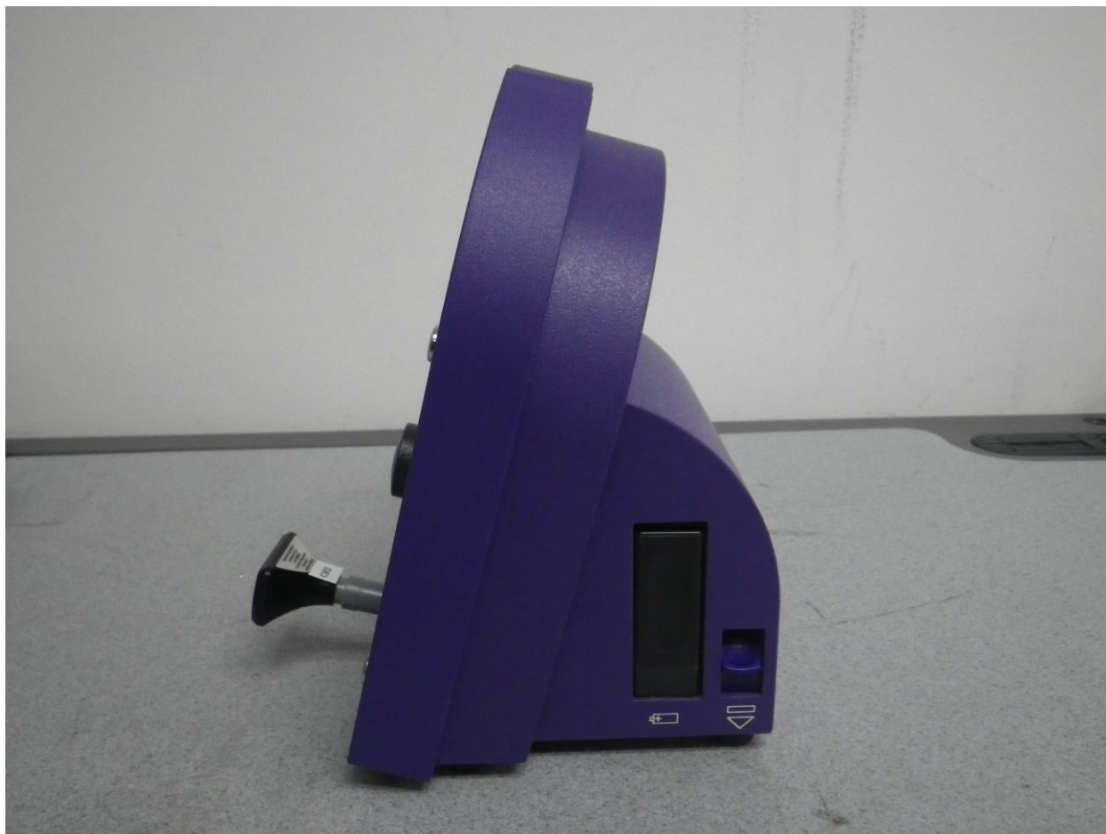
Photograph 3. Dongle, Left