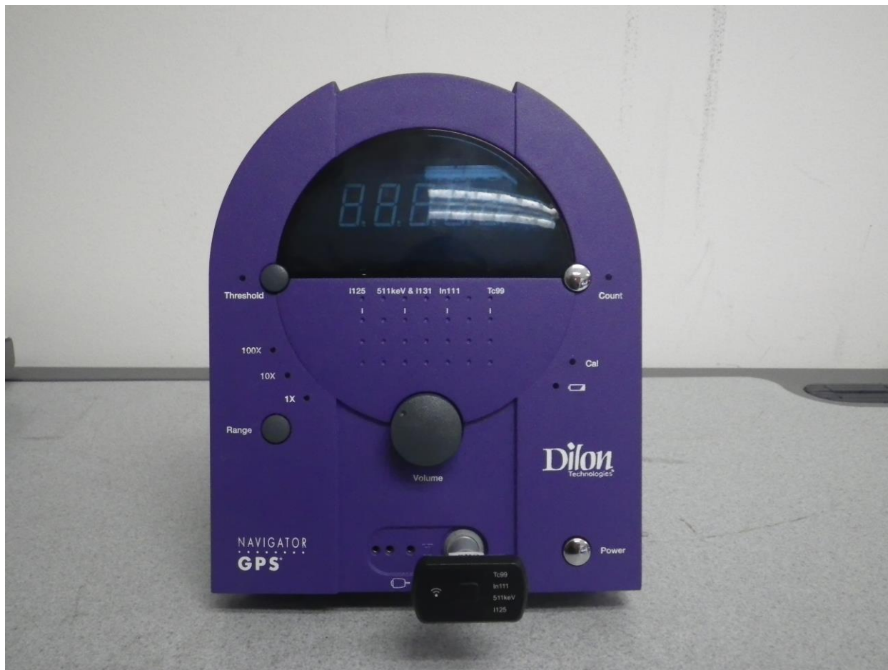
Photograph 2. Dongle, Front