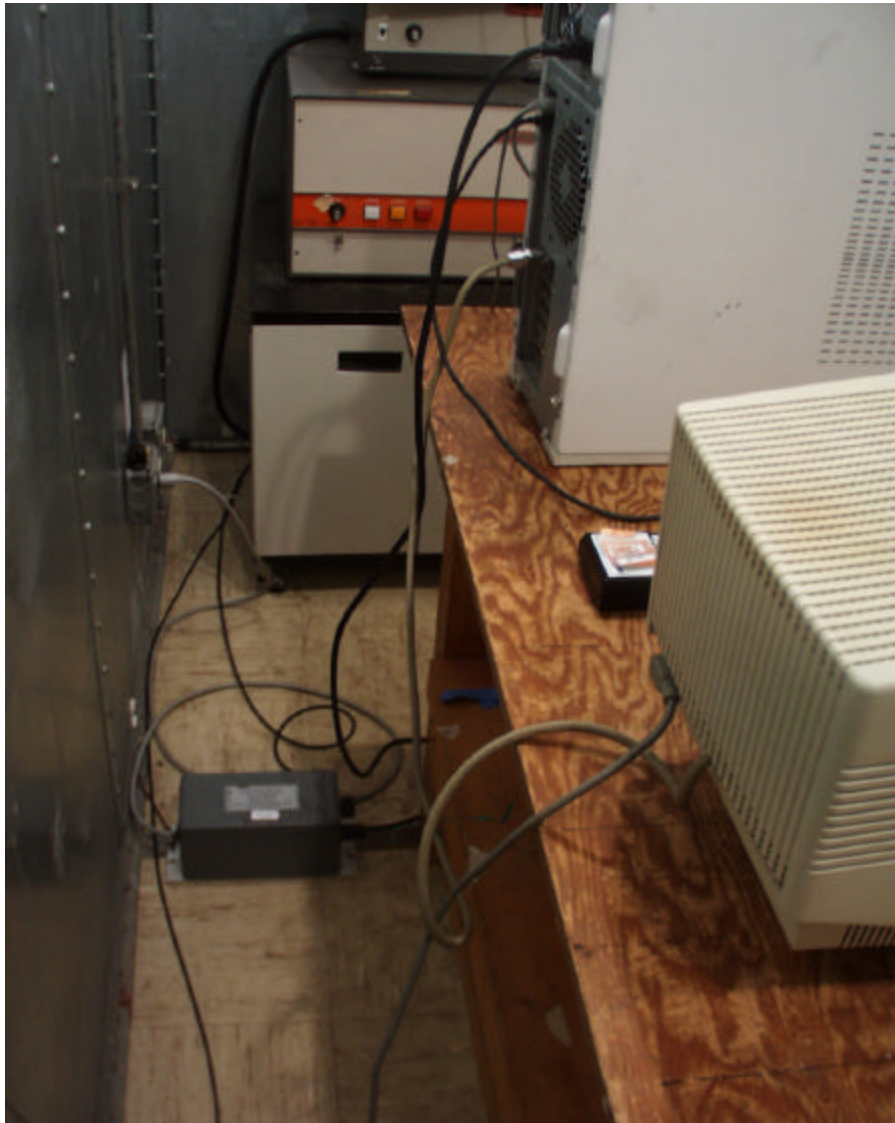
Figure 8. Line Conducted—Rear View.