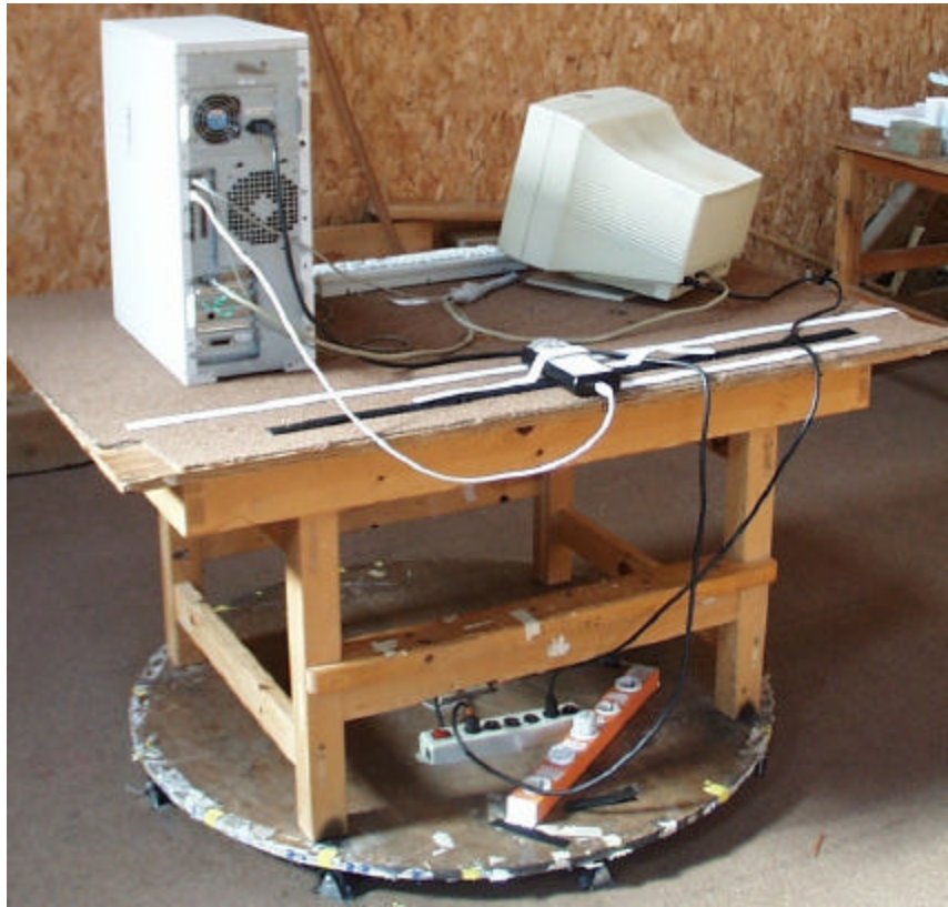
Figure 9. Radiated—Rear View

The rear view of the radiated test setup show the arrangement of highest emissions. Note that the USB cable is routed toward the edge of the table, rather than next to the PC as in the conducted emissions setup. This setup was used for all radiated emissions (E and H-fields).