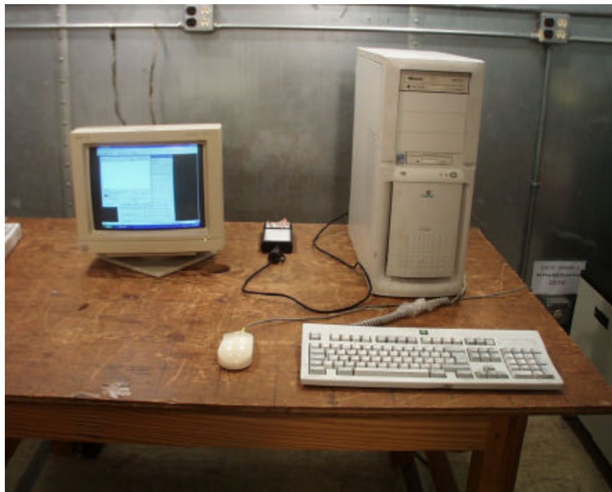
Figure 7. Line Conducted—Front View