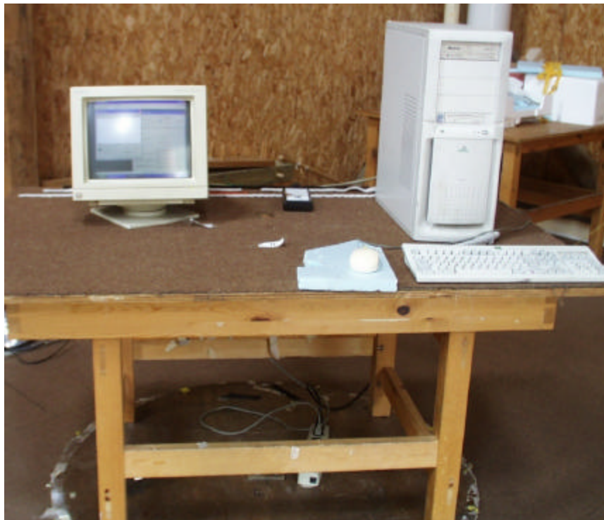
Figure 10. Radiated—Front View

The rear view of the radiated test setup show the arrangement of highest emissions. Note that the USB cable is routed toward the edge of the table, rather than next to the PC as in the conducted emissions setup. This setup was used for all radiated emissions (E and H-fields).