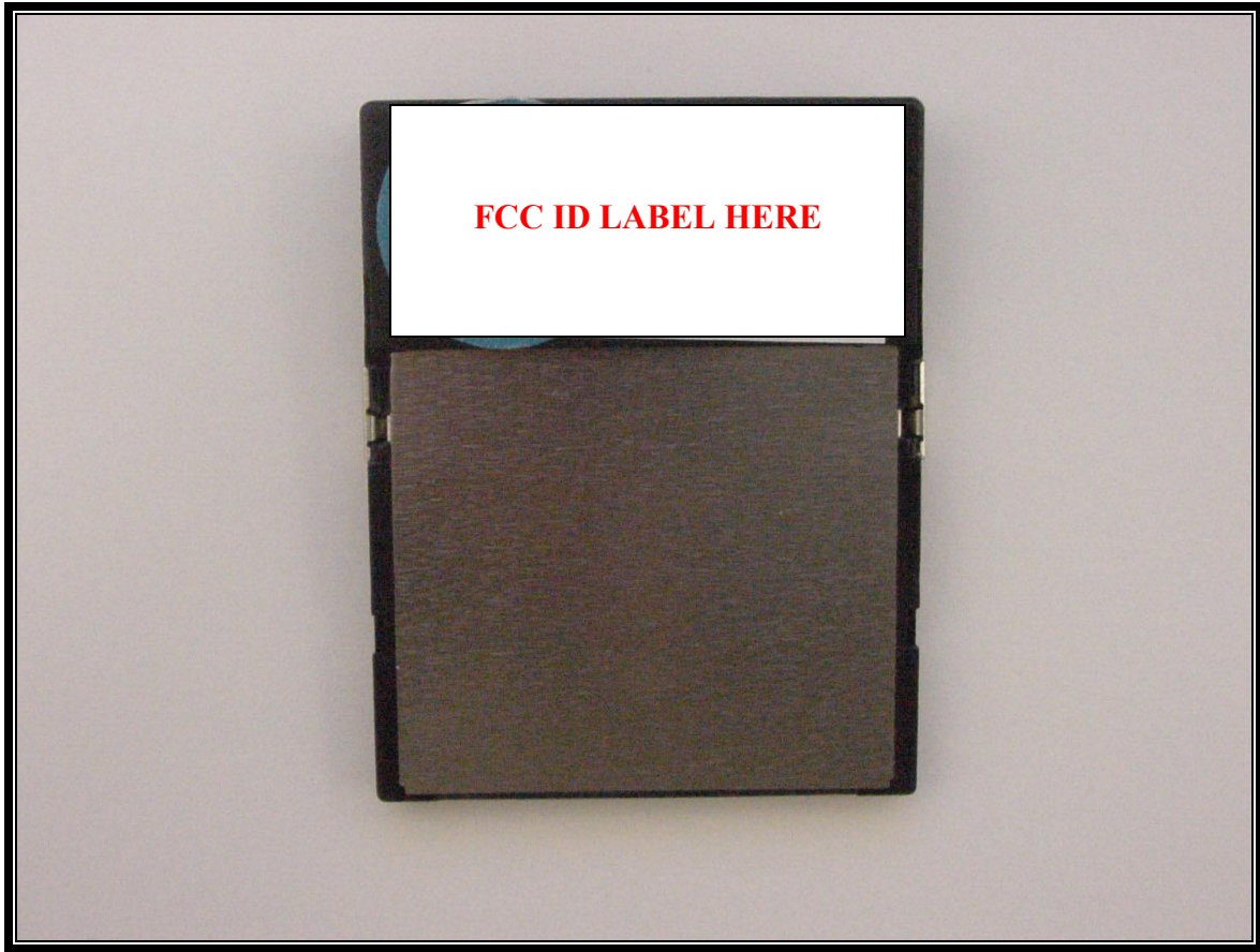
i CFR FCC ID LABEL LOCATION ON REAR OF UNIT