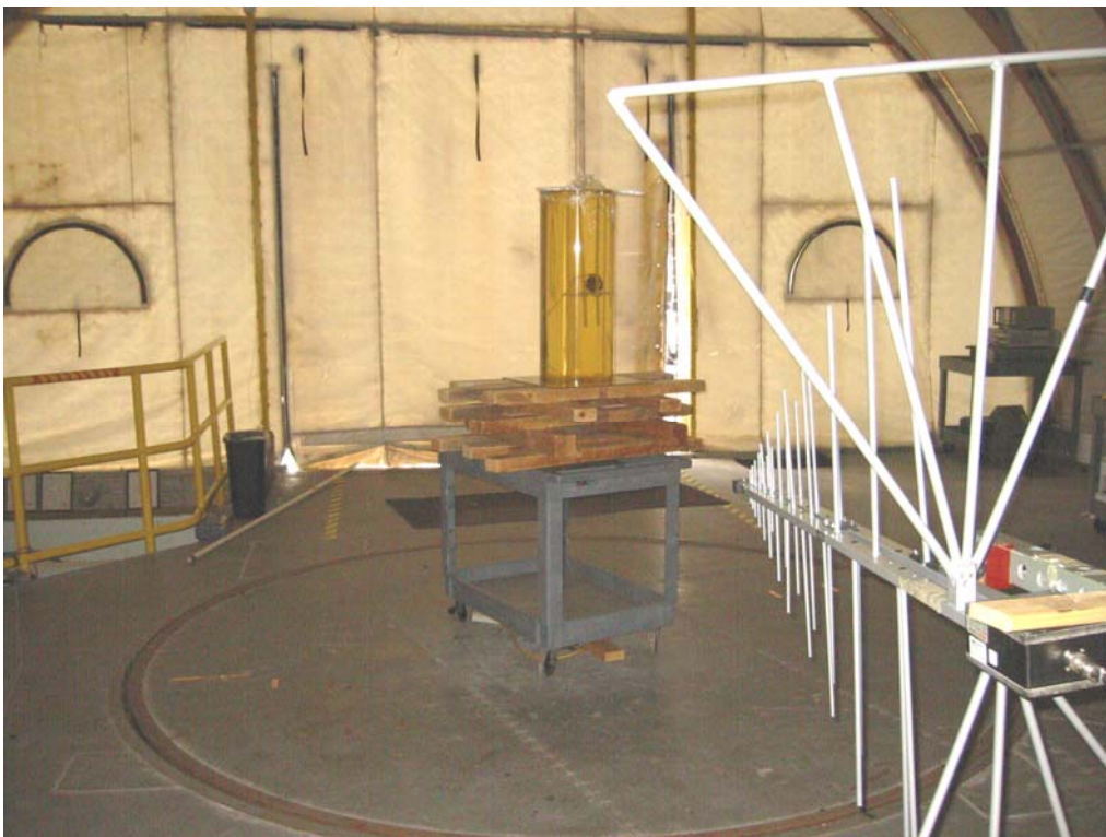
Radiated emissions, 30 – 1000 MHz.