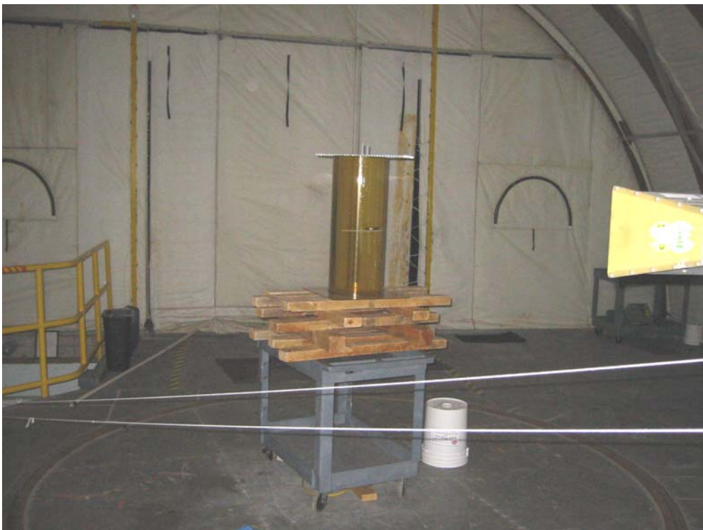
Radiated emissions, 1 – 4.1 GHz.