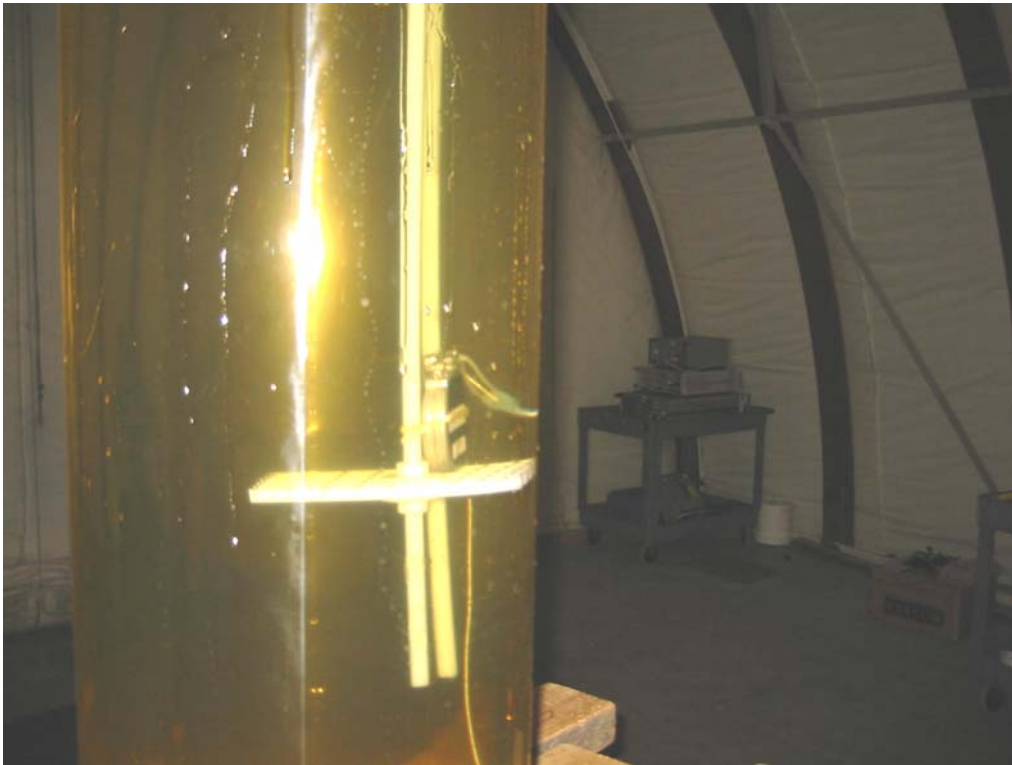
EUT supported 6 cm from torso simulator vertical wall.