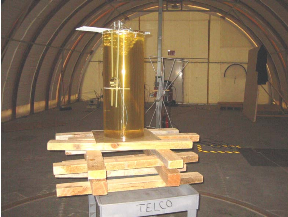
Radiated emissions, 30 – 1000 MHz.