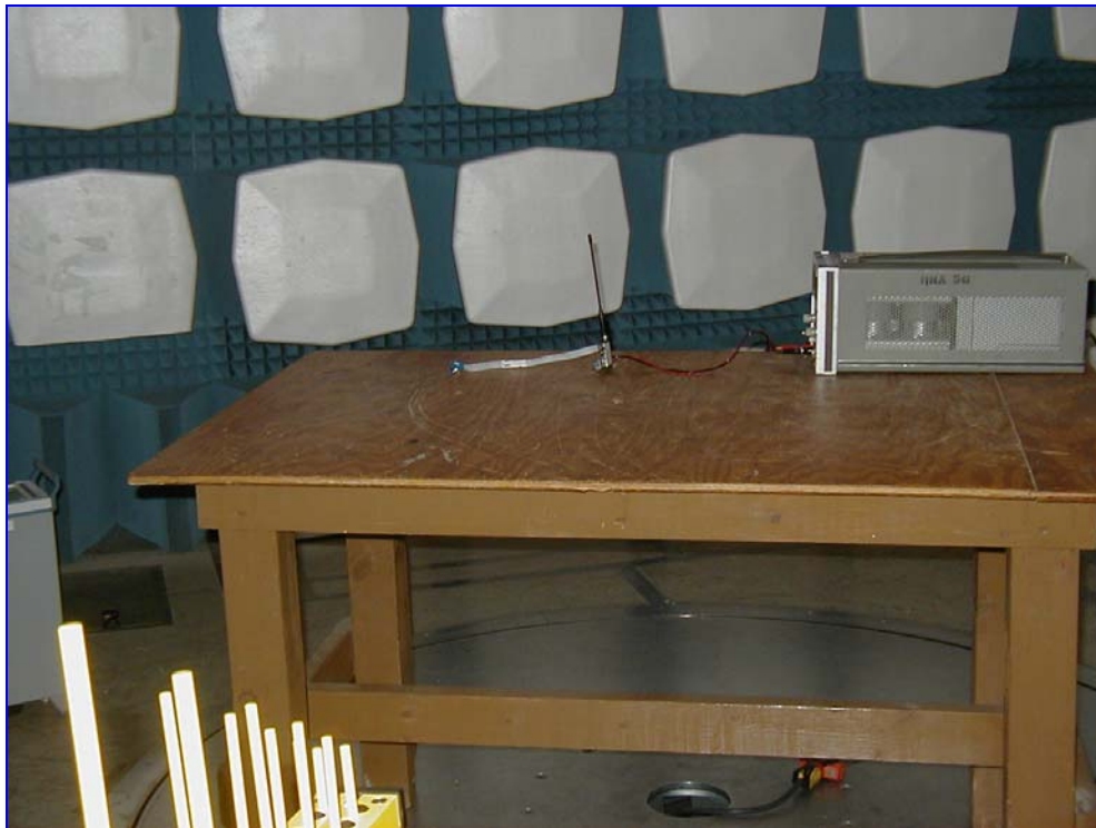
Photograph 1. Radiated Emission Limits Test Setup