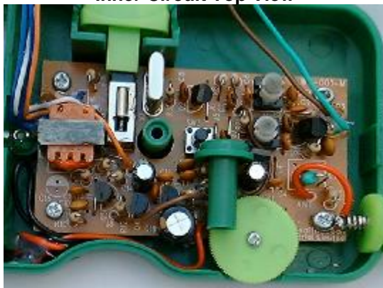
Inner Circuit Top View