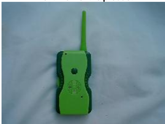
Front View of the product