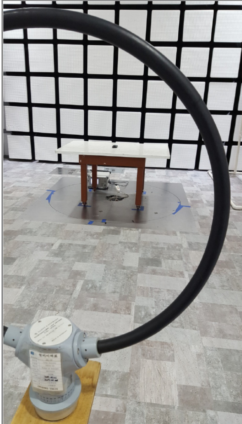
Photo of radiated spurious emission at below 30 MHz