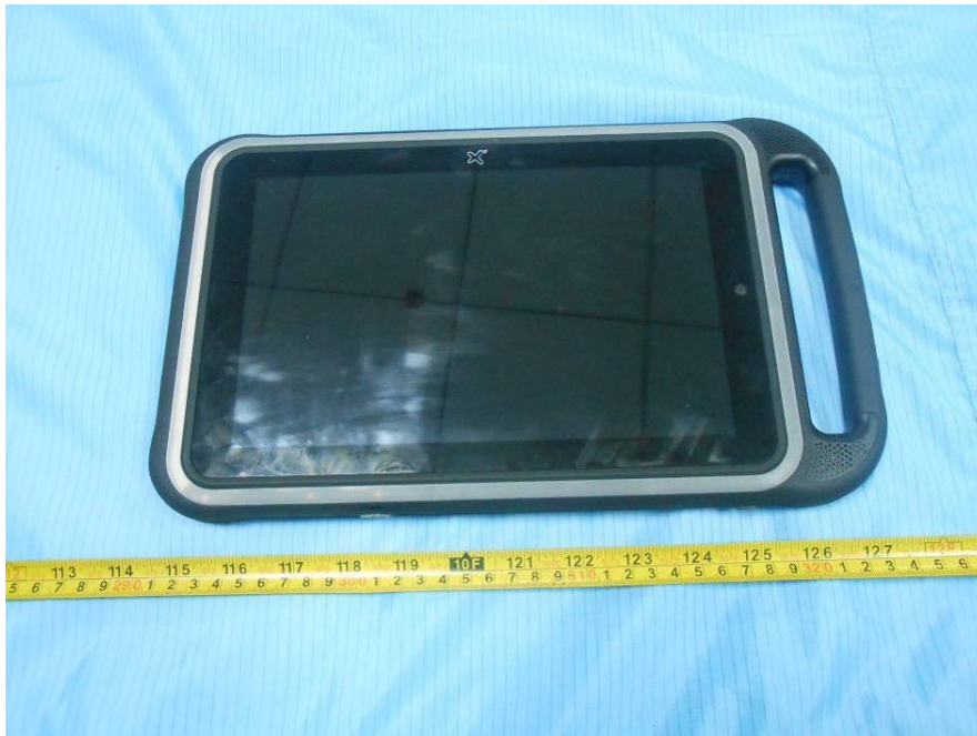
EUT – Front View (White Top Cover, Resistive Touch Panel)