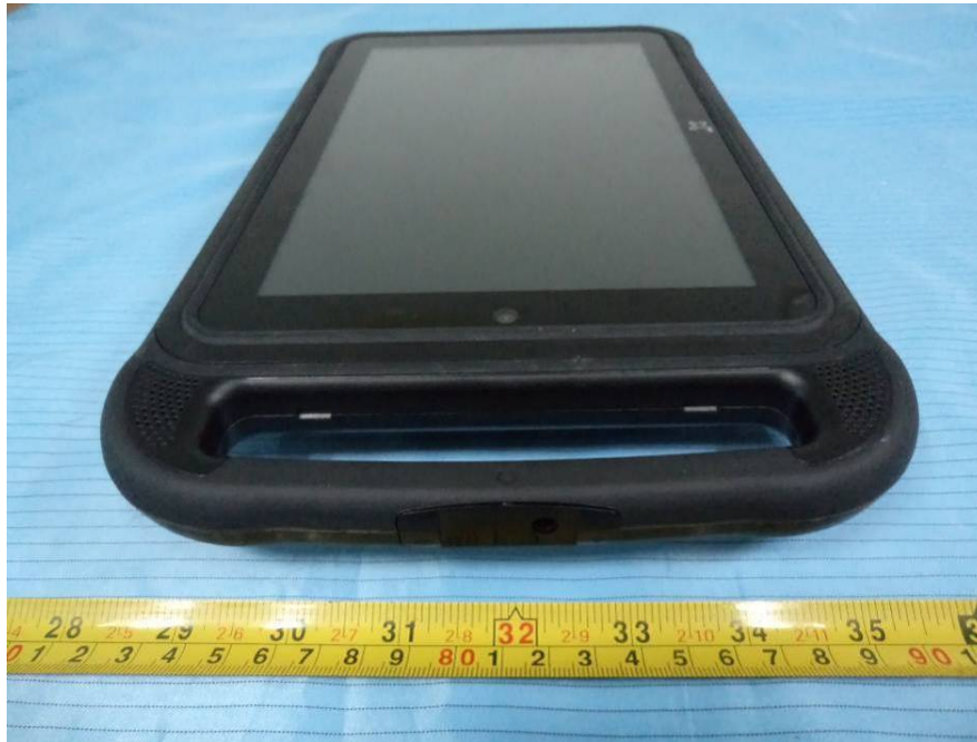
EUT – Front View (Black Top Cover, Resistive Touch Panel)