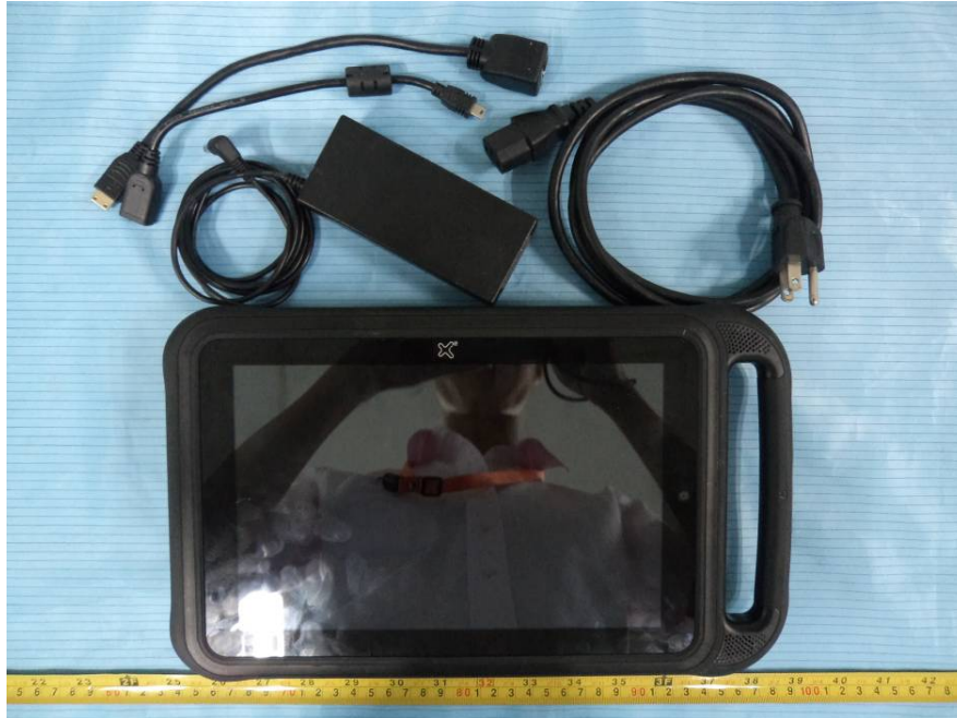
EUT – Front View