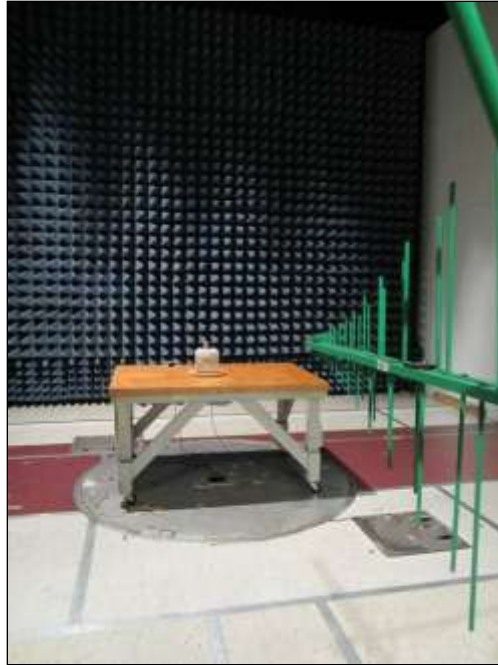
Photograph 5. Radiated Spurious Emissions, Test Setup, 30 MHz – 1 GHz