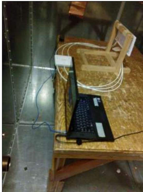
Photograph 4. Conducted Emissions, 15.207(a), Test Setup, Rear View