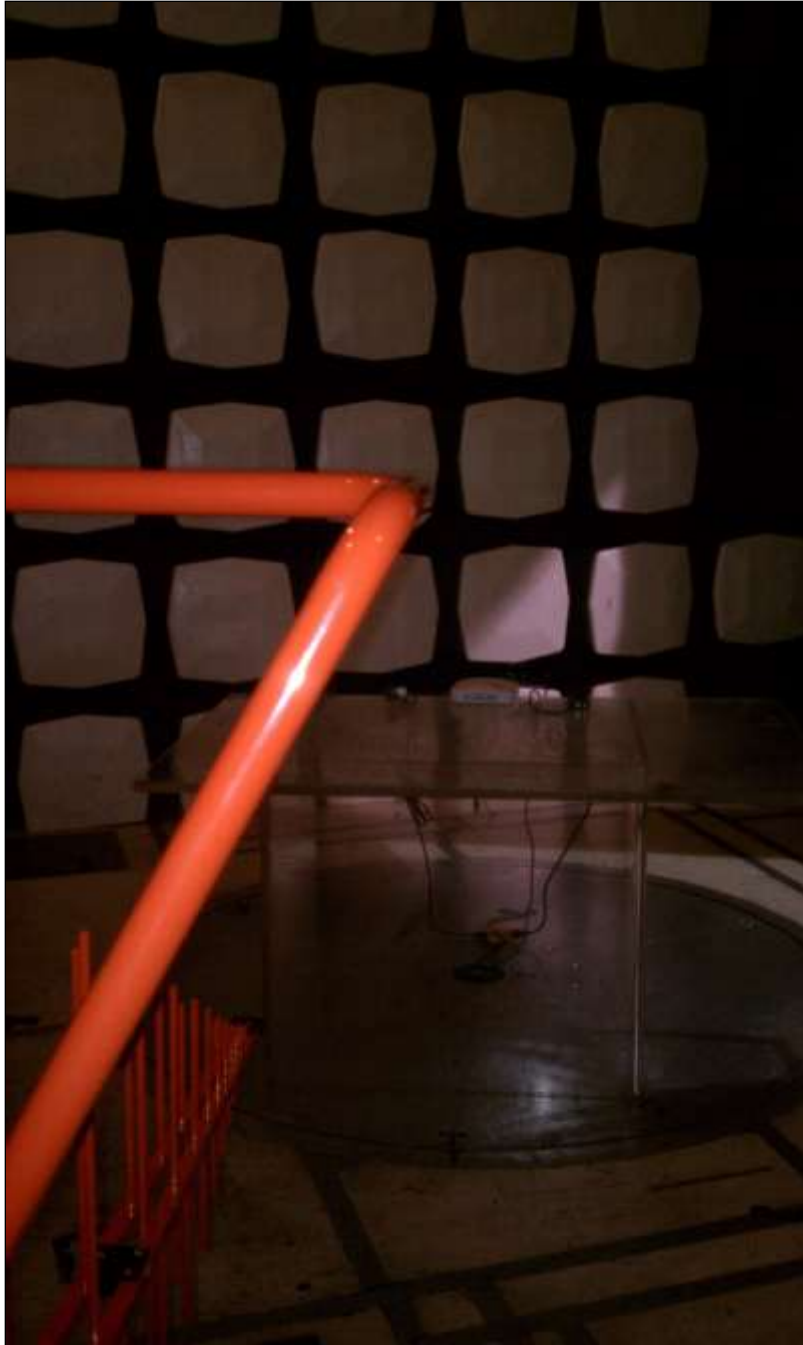
Photograph 2. Radiated Emission, Test Setup