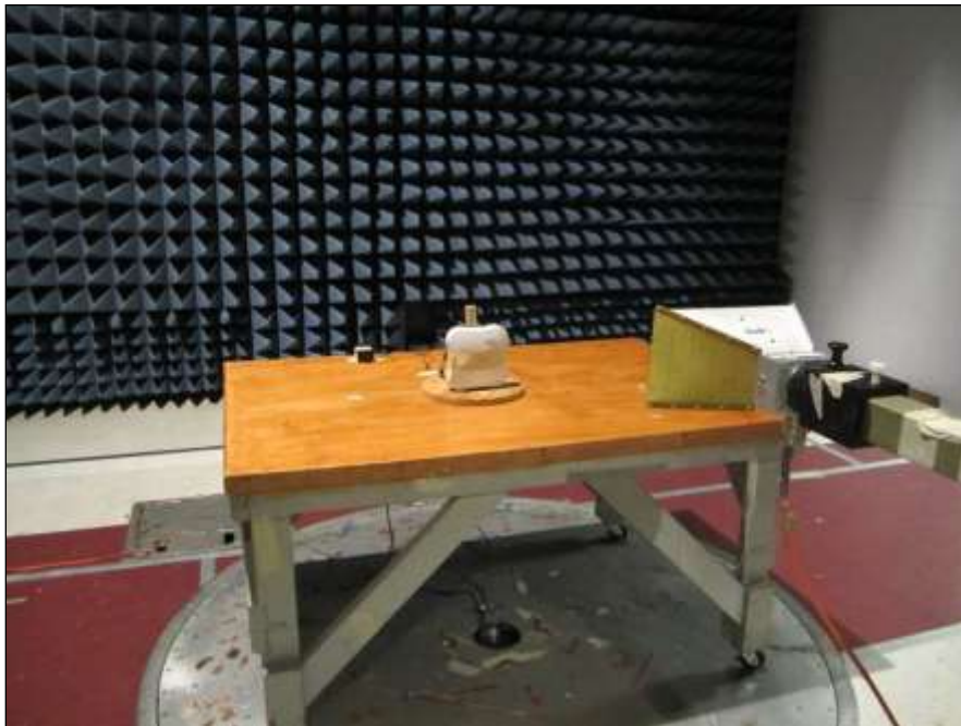
Photograph 6. Radiated Spurious Emissions, Test Setup, 1 GHz – 18 GHz