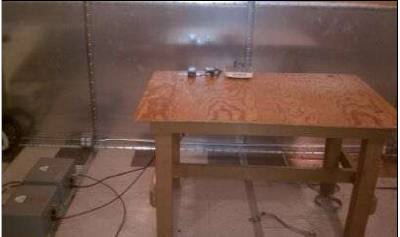
Photograph 1. Conducted Emissions, Test Setup