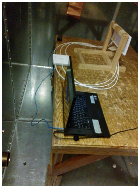
Photograph 4. Conducted Emissions, 15.207(a), Test Setup, Rear View