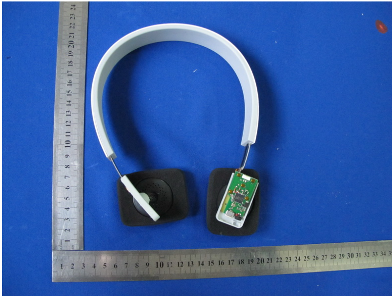
Photo 5 Appearance of PCB