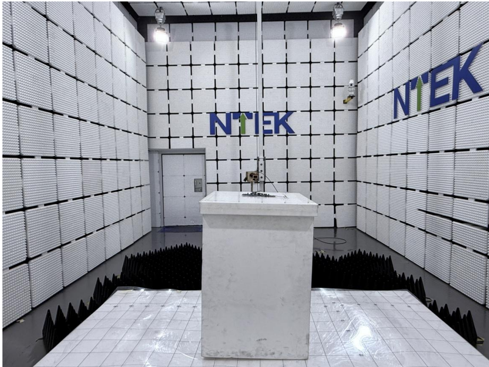
AC Conducted Measurement Photos