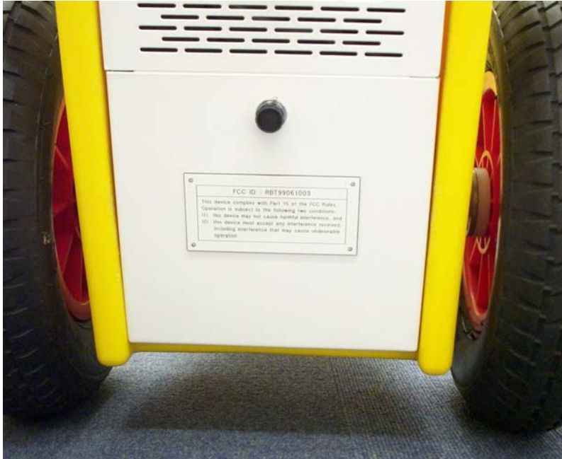
External Photograph showing position of FCC ID Label.

Re: FCC ID RBT 99061003 Applicant PipeHawk plc Correspondence Reference Number 25574 731 Confirmation Number EA540369