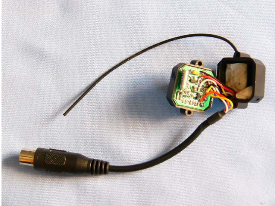
(4) Main board component side