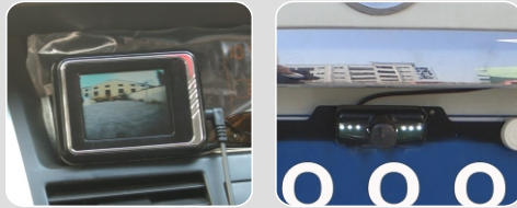
9. live picture when backing a car