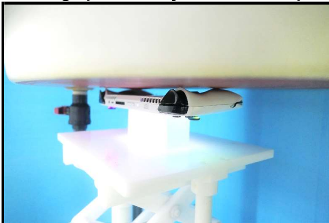
Rear Face of EUT Tested at 0 mm