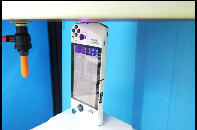
Right Side of EUT Tested at 0 mm