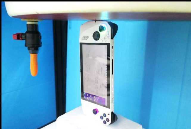
Left Side of EUT Tested at 0 mm