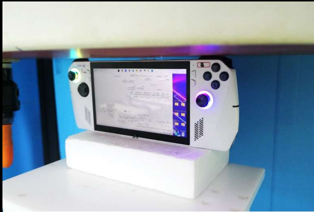
Top Side of EUT Tested at 0 mm