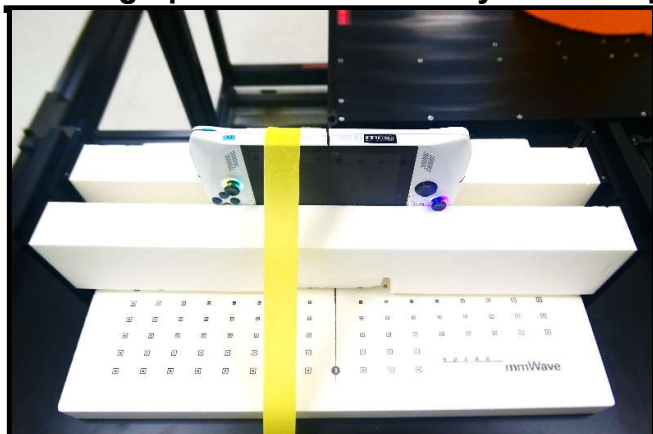
Bottom Side of EUT Tested at 0 mm