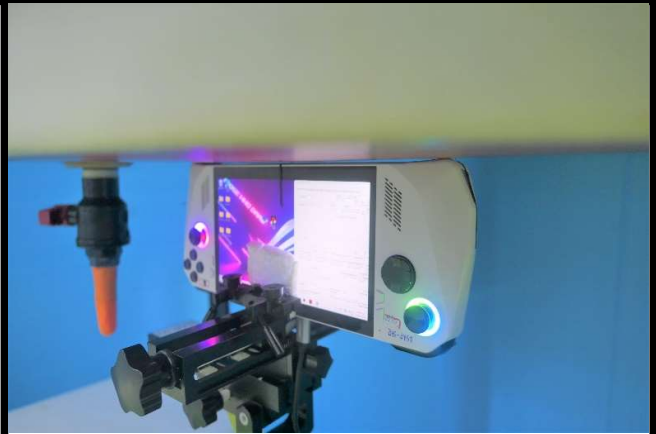
Bottom Side of EUT Tested at 0 mm