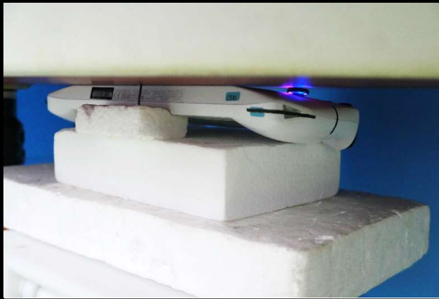
Front Face of EUT Tested at 0 mm