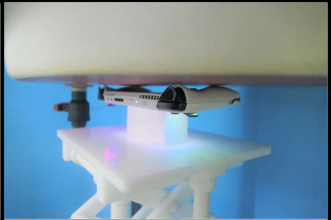
Rear Face of EUT Tested at 0 mm