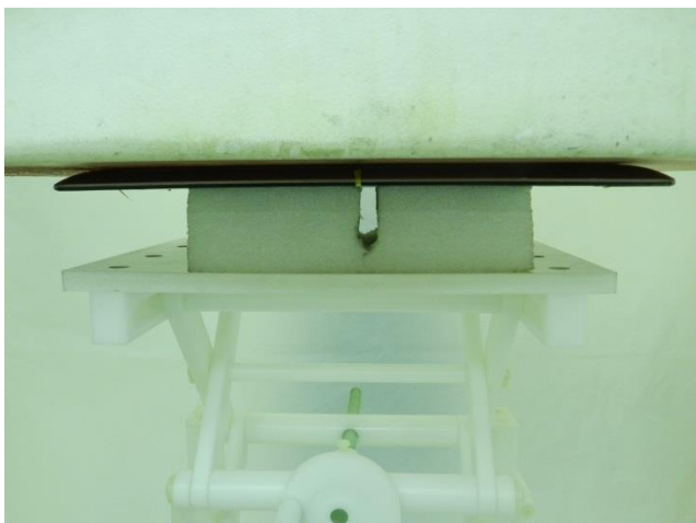
Bottom Face, Test Separation 0 cm