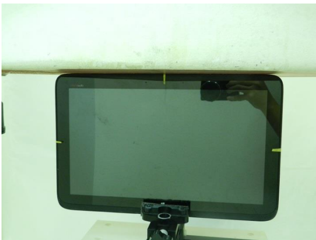
Edge1, Test Separation 0 cm