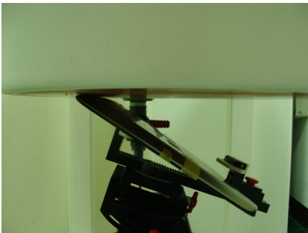
Curved surface of Edge1, Test Separation 0 cm