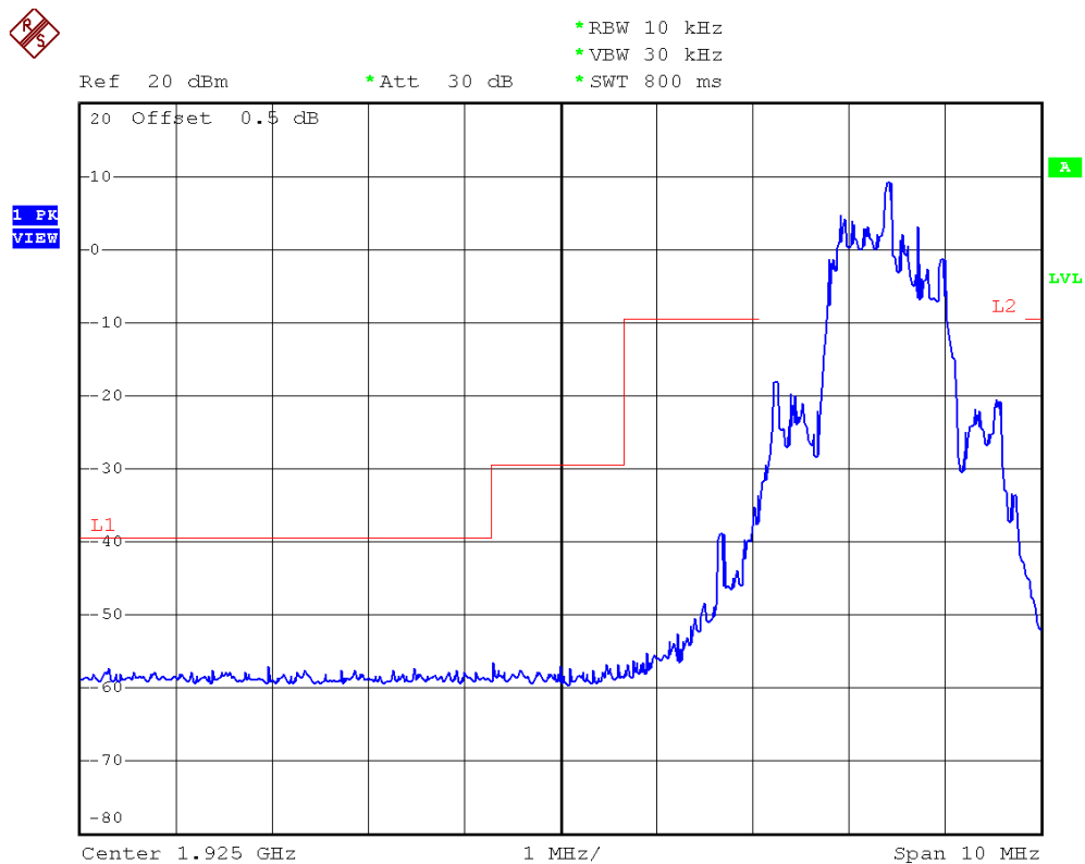
Plot 4D. Highest Channel Unwanted Emission Inside the Sub-Band (Dummy Carrier)