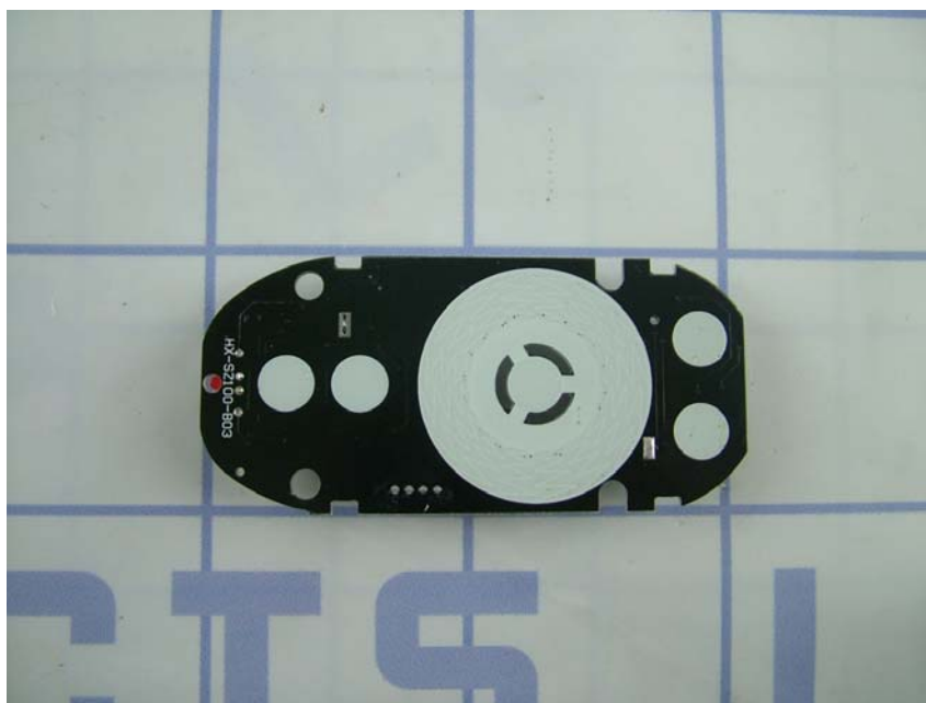
Place of the TX PCB2