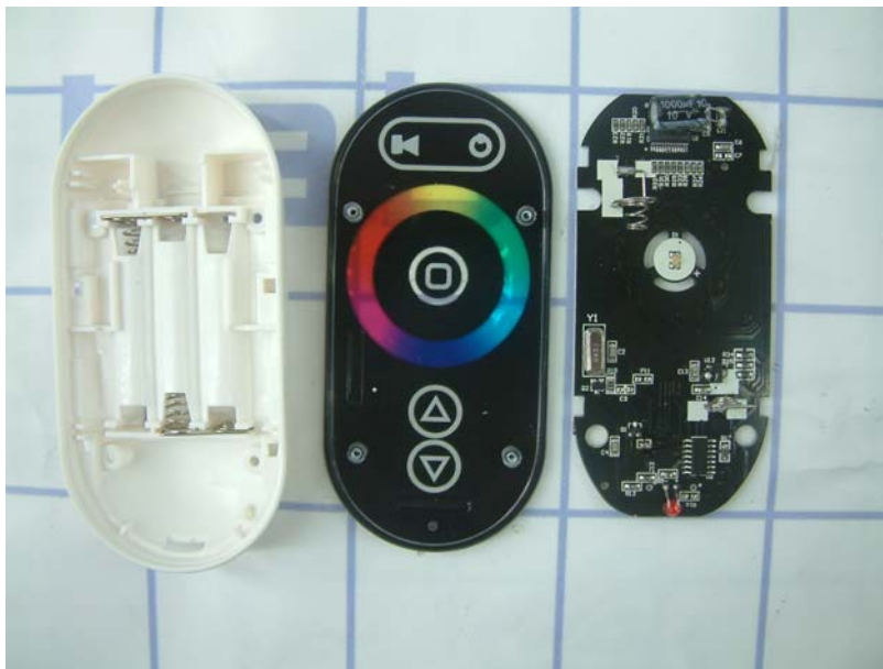
TX Internal view