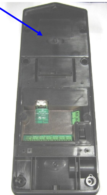
Physical Location of FCC Label on EUT