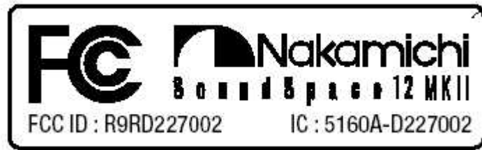
Sample Label – Wireless Speaker (Left/Right)

The label shown will be permanently affixed at a conspicuous location on the device and be readily visible to the user at the time of purchase.