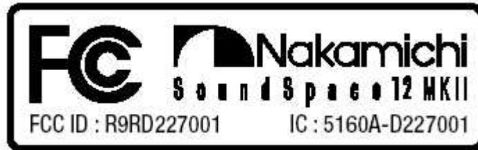
Sample Label – AV Unit

The label shown will be permanently affixed at a conspicuous location on the device and be readily visible to the user at the time of purchase.