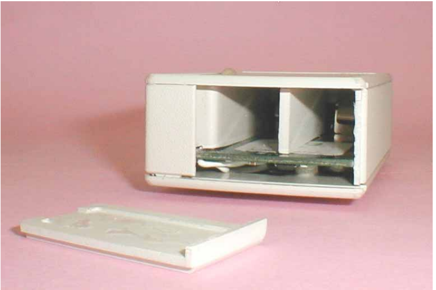
Battery Cover Removed