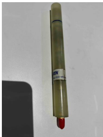
Fig 1 dipole model 3126-2500 frequency 2500 MHz