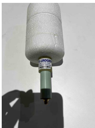
Fig 2 model 3126-5500 frequency 5500 MHz