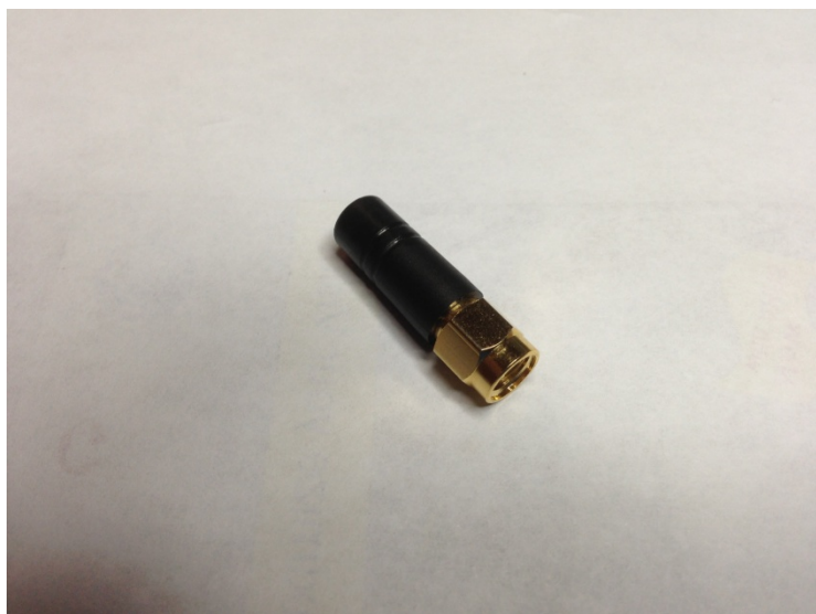
Top view of WiFi Antenna

Antenna is specifically designed by Roving Networks to be used on their WiFi Module. Part number is RN-SMA-S-RP. This is a reverse polarity connector.