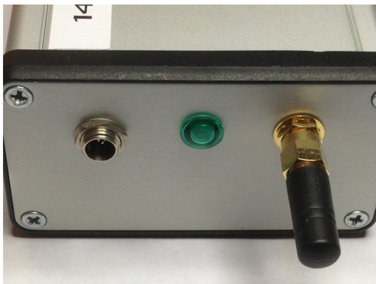
Transceiver unit with WiFi Antenna attached

Antenna is specifically designed by Roving Networks to be used on their WiFi Module. Part number is RN-SMA-S-RP. This is a reverse polarity connector.