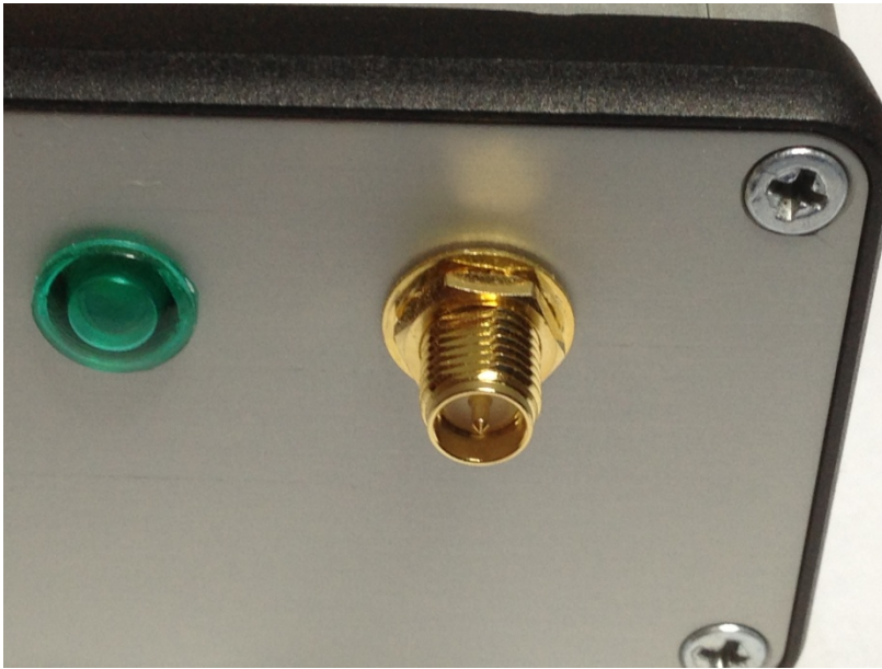
View of Transceiver unit with WiFi Antenna Receptacle NOTE: Male pin in center of connector