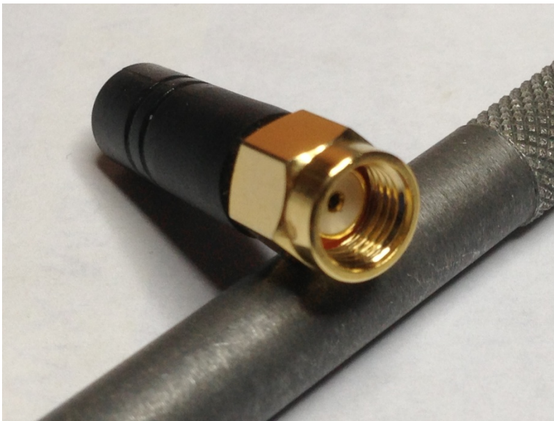
Side view of WiFi Antenna

NOTE: Female receptacle in center of connector