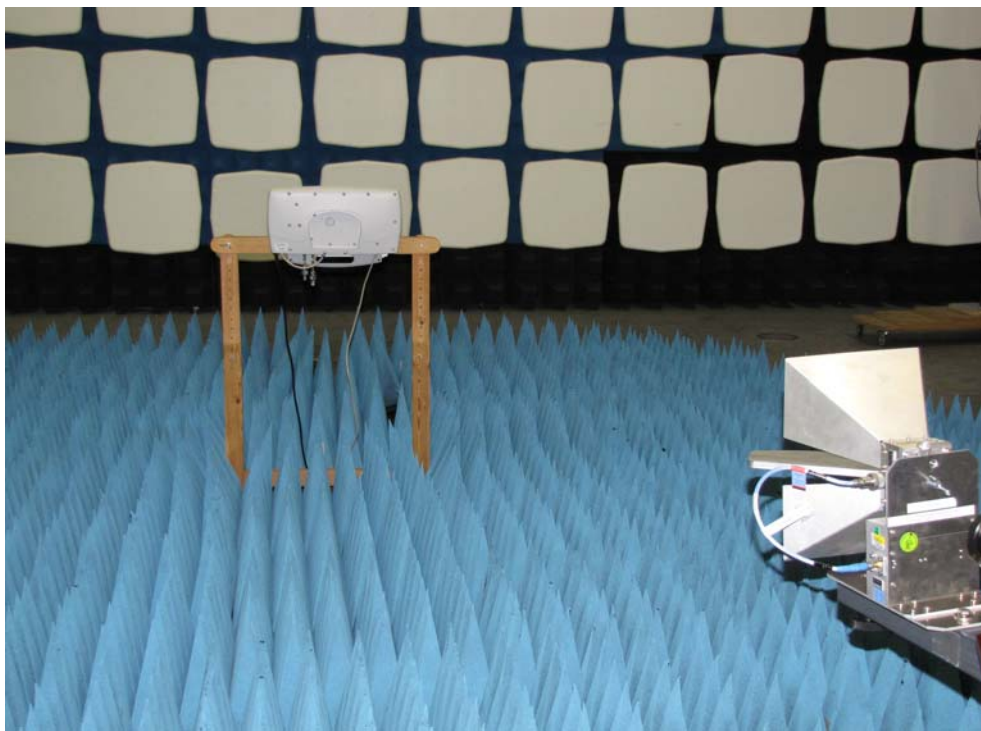
Radiated spurious emission above 1 GHz