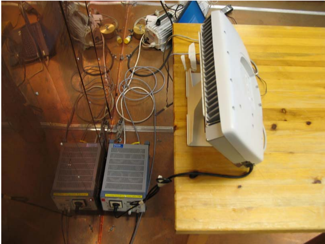
AC Line conducted emission 150 KHZ to 30 MHZ