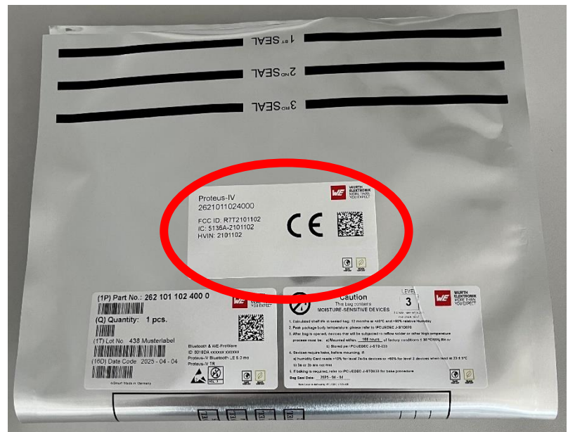
Placement of the packaging label

The font size used, is 2.5pt and thus smaller than 4pt (~1.27mm). The FCCID, ISED and HVIN number do not fit to the label due to the small size. It is part of the user manual and part of the label of the packaging.