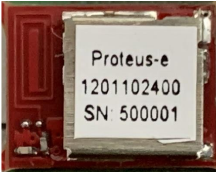
Placement of the module label

The Proteus-e label has the size of 5x5mm. It contains the device name “Proteus-e”, parts of its article number “1201102400” and the serial number of the entity. The 1201102 is the HVIN. The label is placed on the shielding of the radio module.