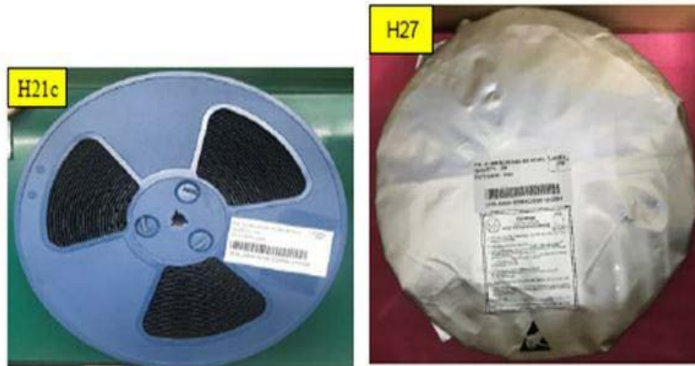
Figure 2: Placement Location of FCC/IC Label

Due to size limitation, the label is placed on the reel and packaging material containing the module.