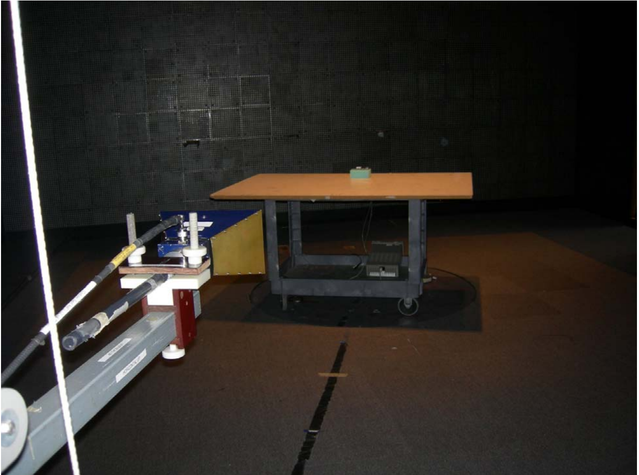
Figure 4: Radiated Emissions – Internal Antenna