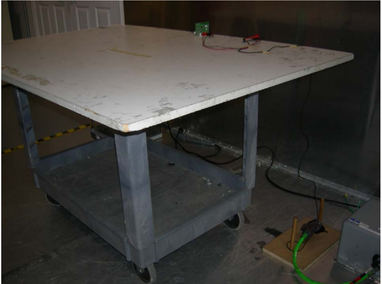
Figure 6: Conducted Emissions