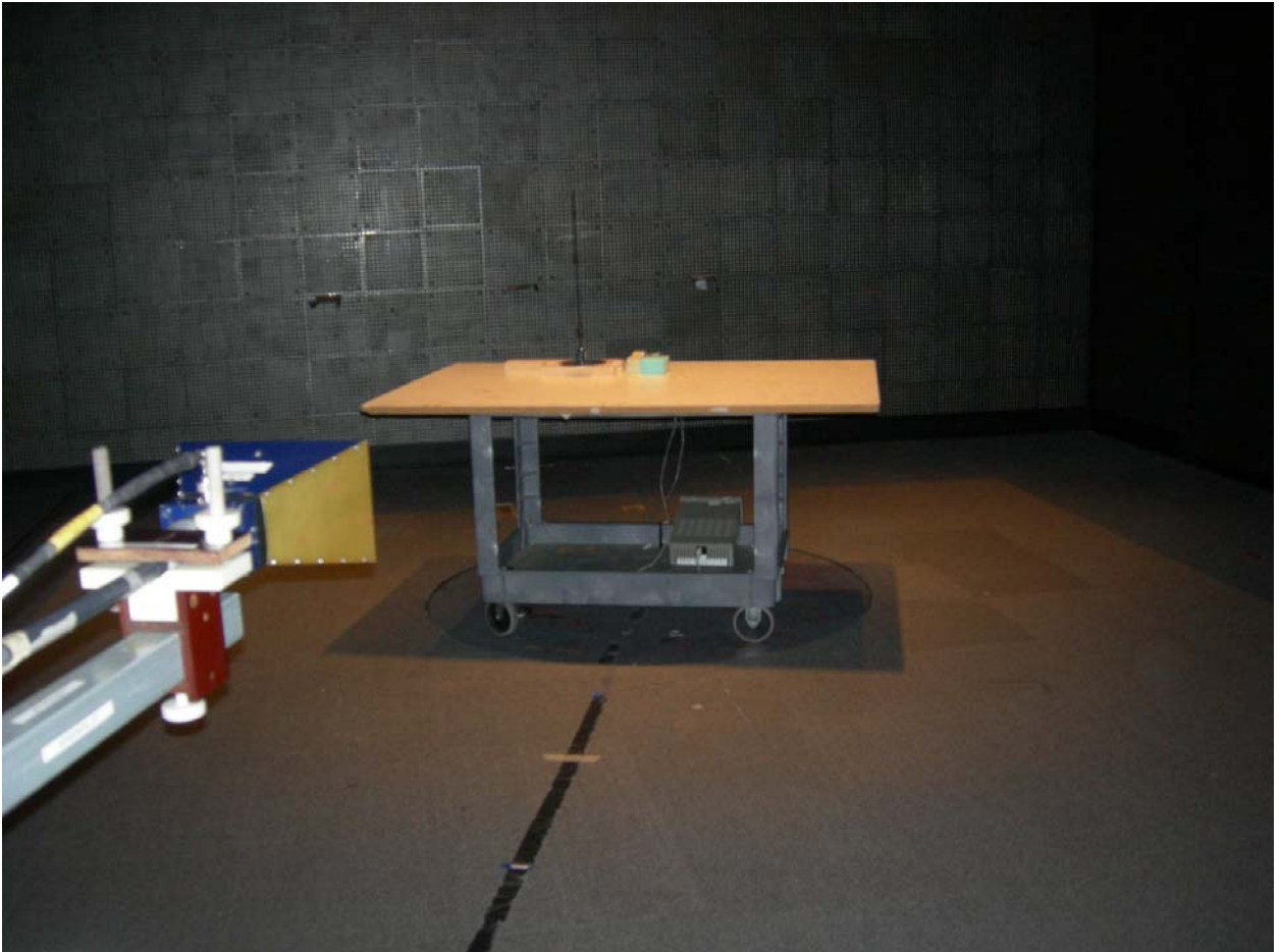
Figure 1: Radiated Emissions – External Antenna