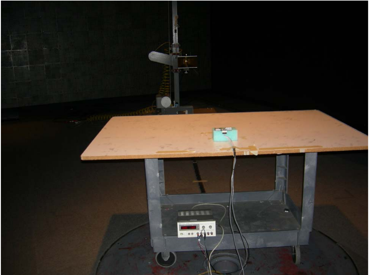
Figure 3: Radiated Emissions – Internal Antenna