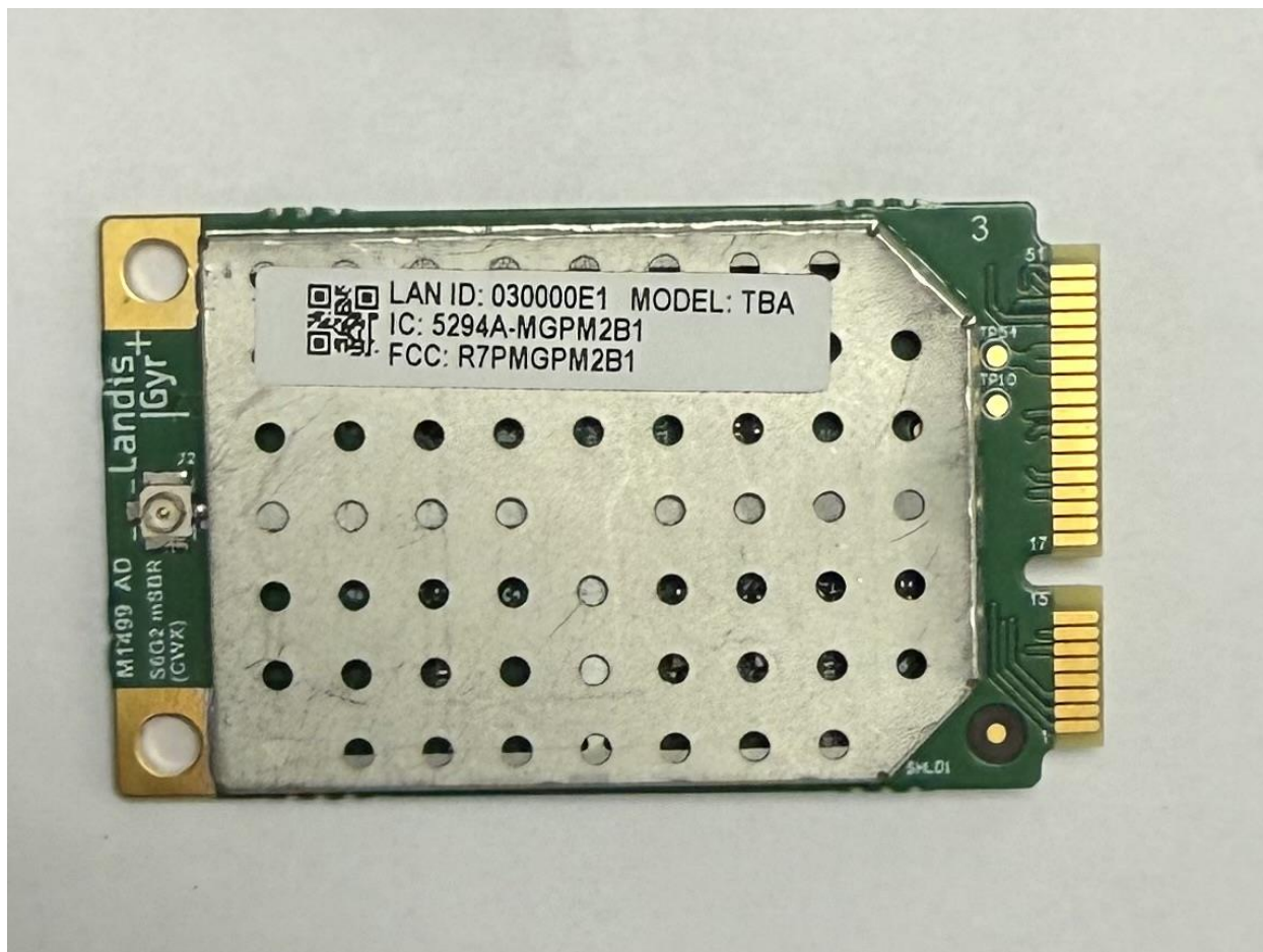
Figure 1: PCB Front with Shields