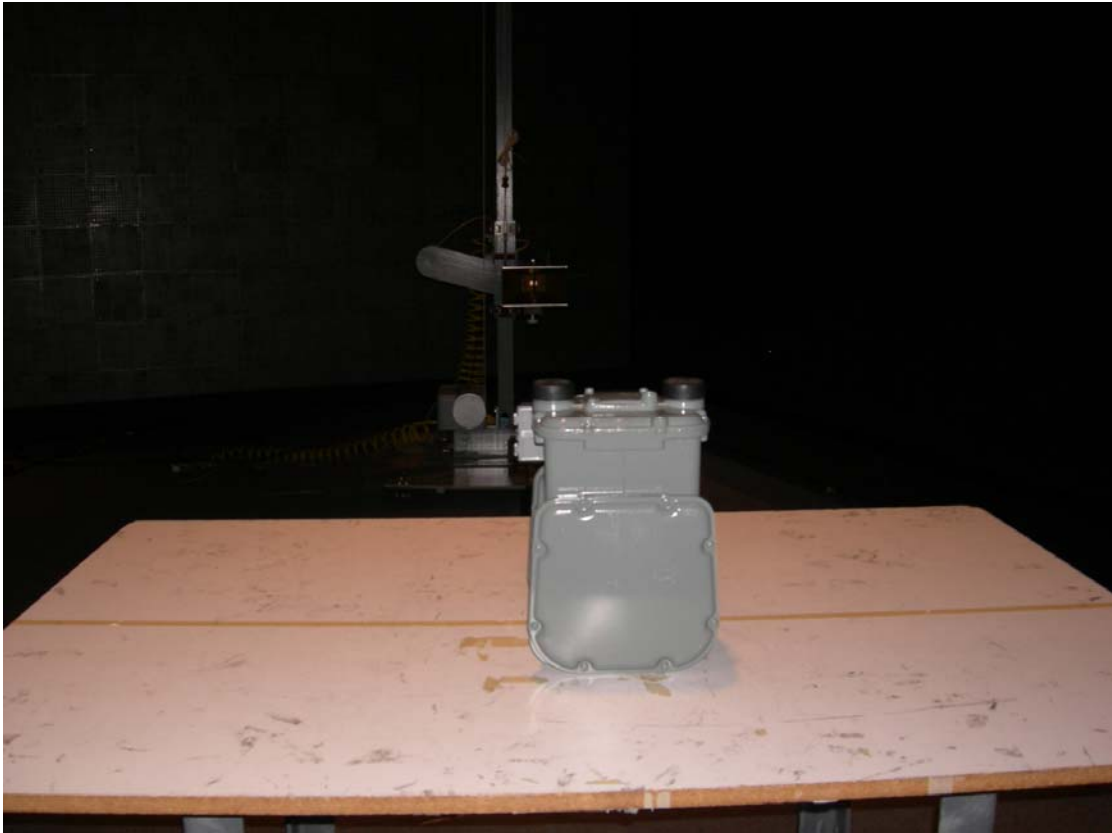
Figure 2: Radiated Emissions