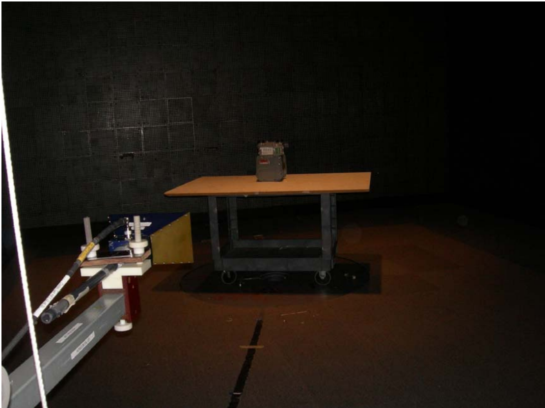
Figure 1: Radiated Emissions