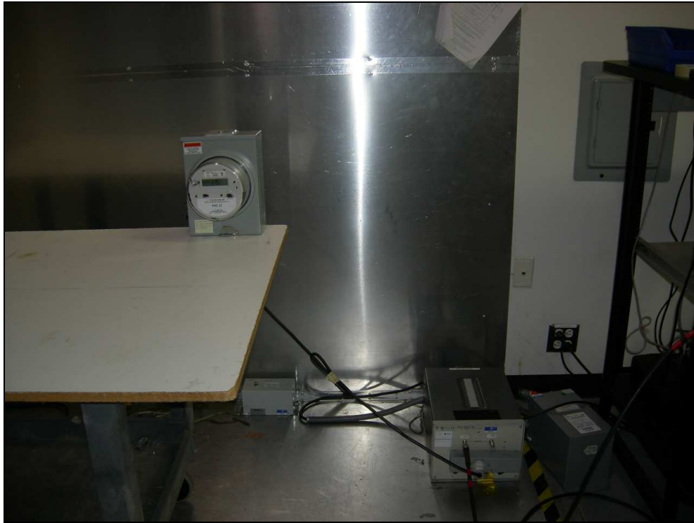
Figure 3: Conducted Emissions