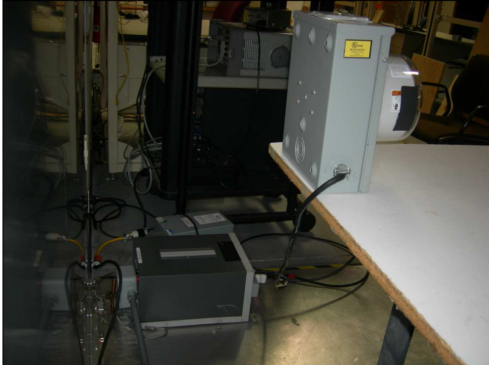
Figure 4: Conducted Emissions