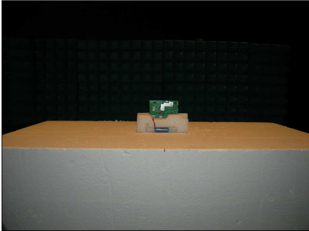
Figure 1: Radiated Emissions