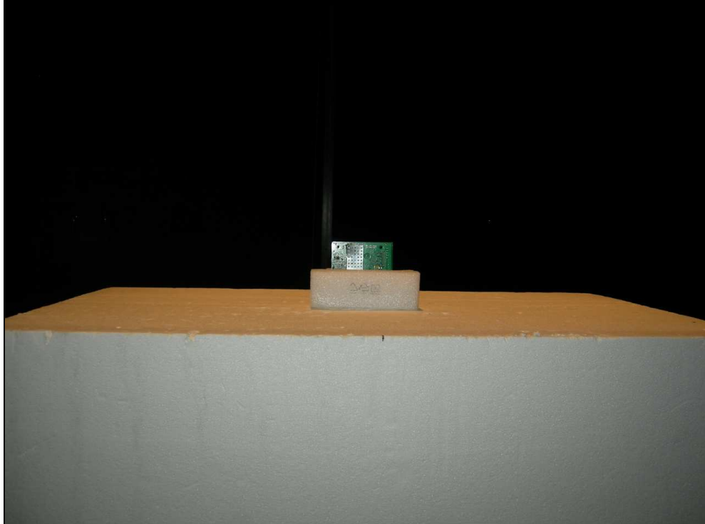
Figure 2: Radiated Emissions