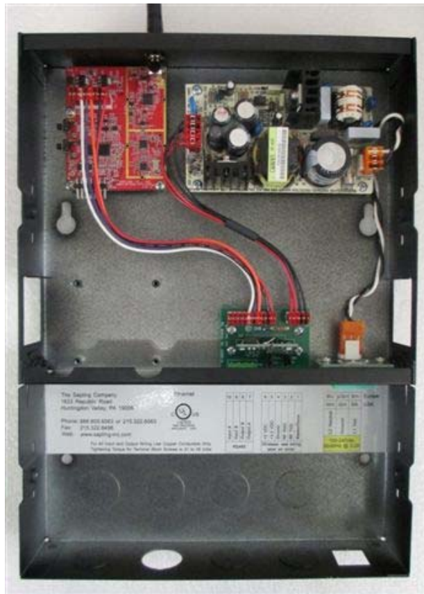
Model Number: D-CCA-HPB-24G-1 installed in SMA-1SR-G000-1 (Repeater), Internal Photograph