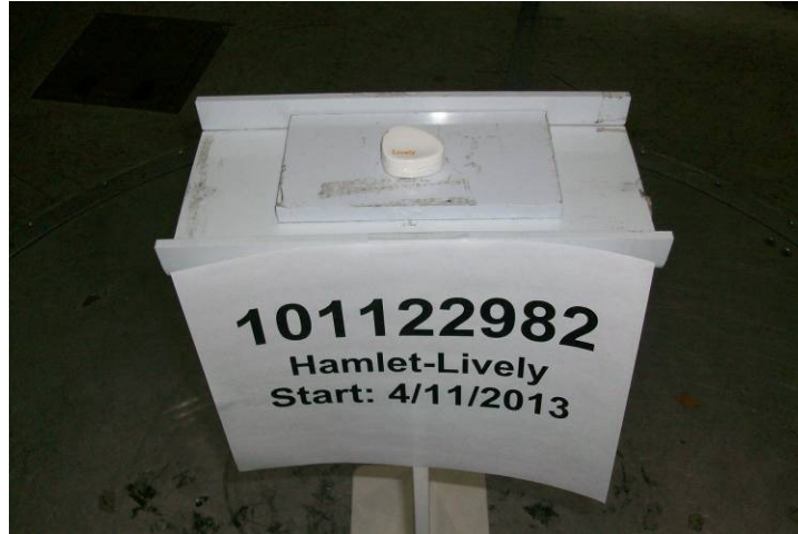
Product Test Axis 2 – EUT Vertical