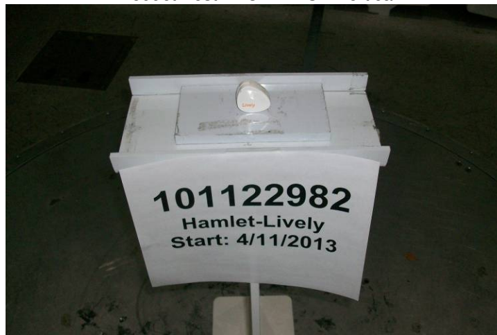
Product Test Axis 3 – EUT Vertical & Rotated 90°