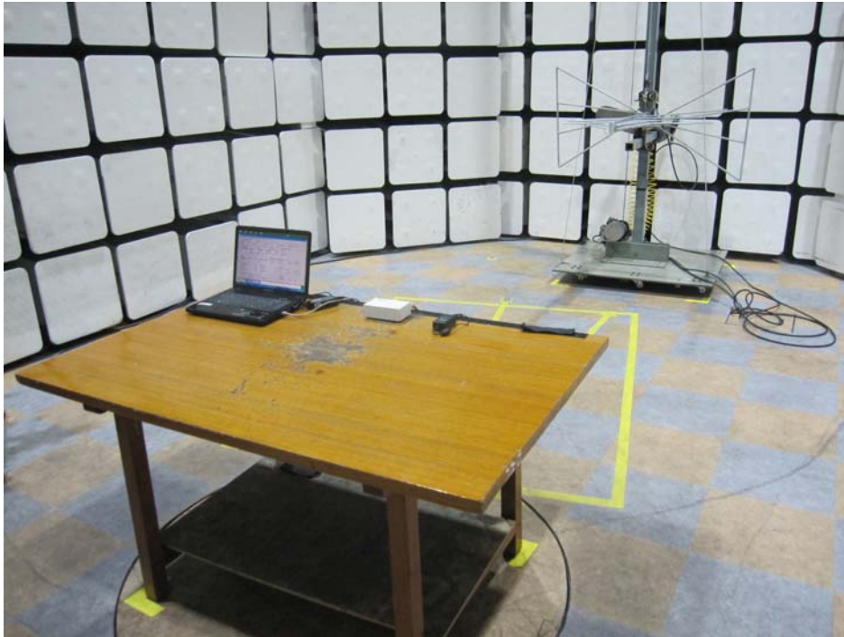
Radiated RF measurement (Below 1 GHz)