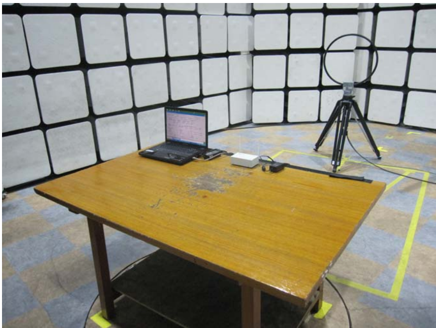
Radiated RF measurement (Below 30 MHz)