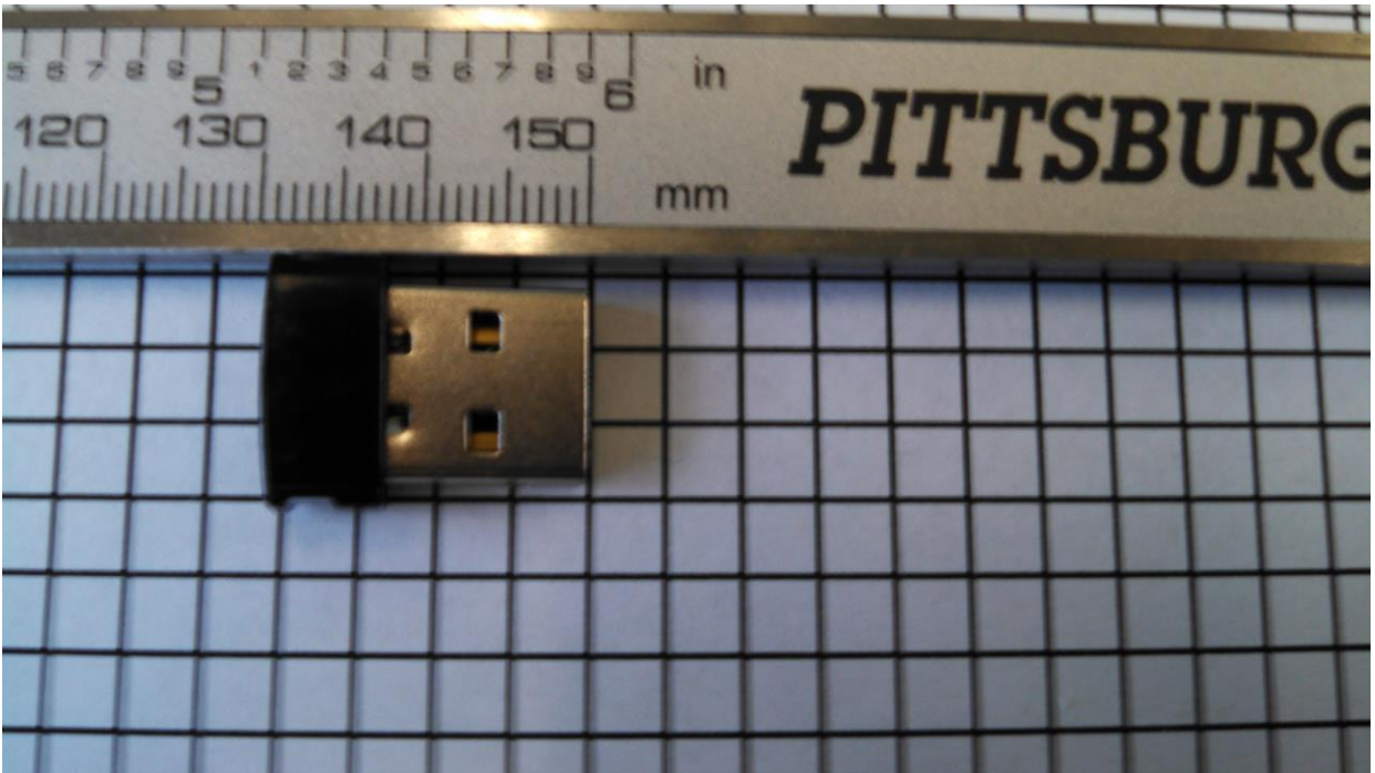
Figure 4. External view of Gimbal U-Series 5 Proximity Beacon (Back) Depth 19.3 MM