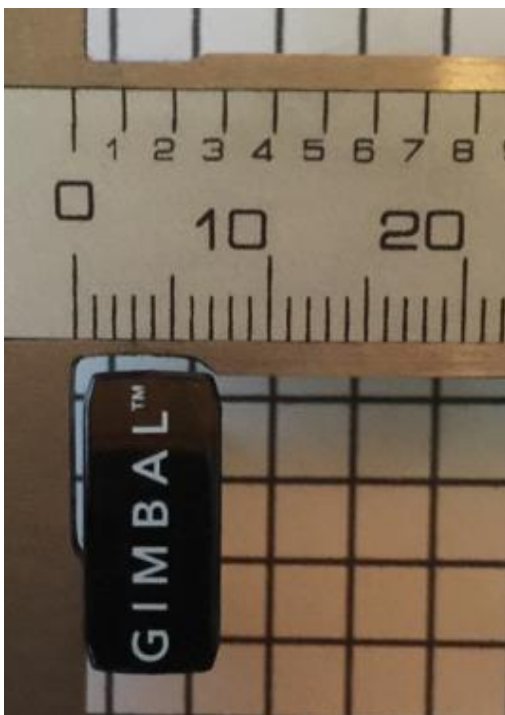
Figure 2. External view of Gimbal U-Series 5 Proximity Beacon (Top) Height 7.1 MM