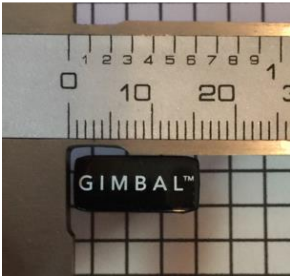
Figure 1. External view of Gimbal U-Series 5 Proximity Beacon (Top) Width 15.6 MM