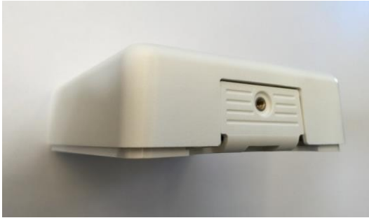
Figure 4: Properly closed Beacon is NOT flush

DO NOT apply excessive pressure while closing the Beacon or after it has been installed as doing so can damage the Beacon