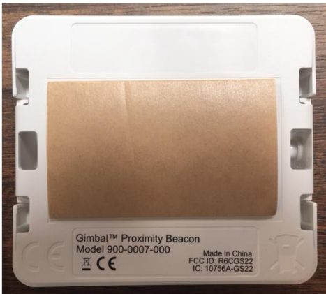
Figure 1: Bottom housing with double-sided tape applied