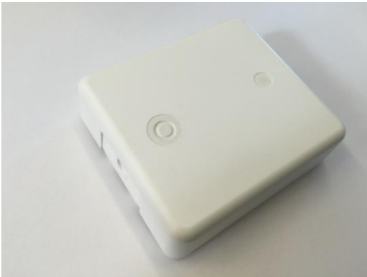
Figure 3: Top housing installed