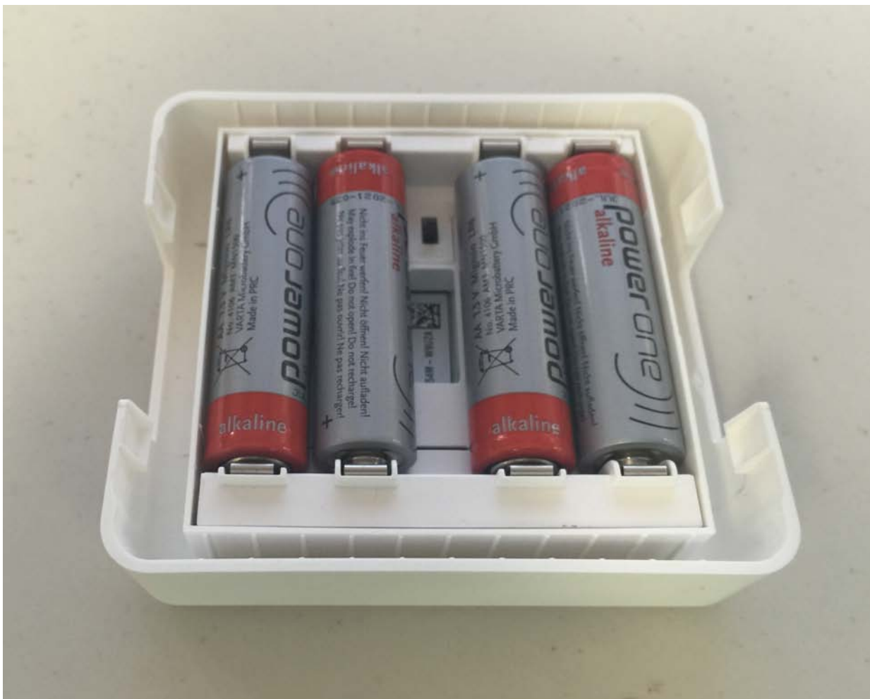
Figure 1: Inside battery compartment