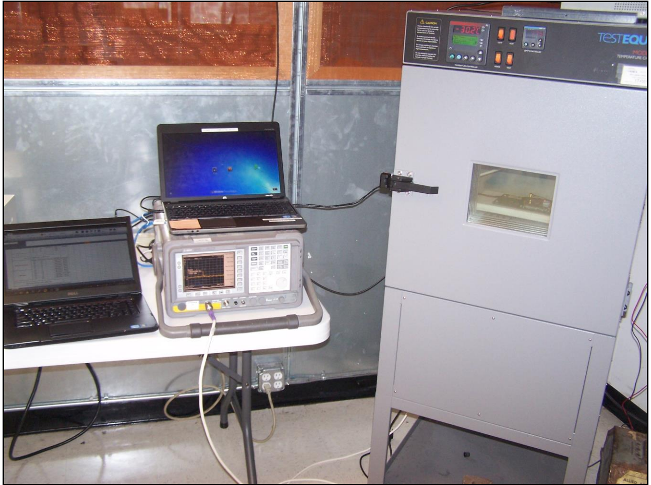
Photograph 4. Frequency Stability, Test Setup