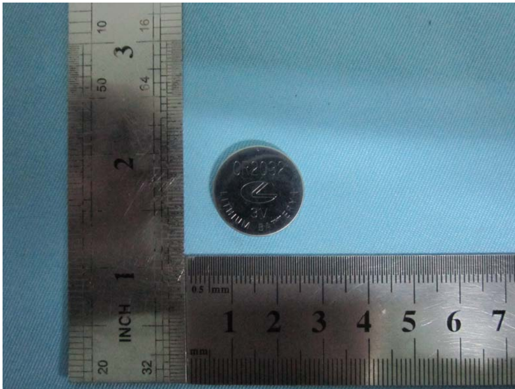
Battery - Positive View