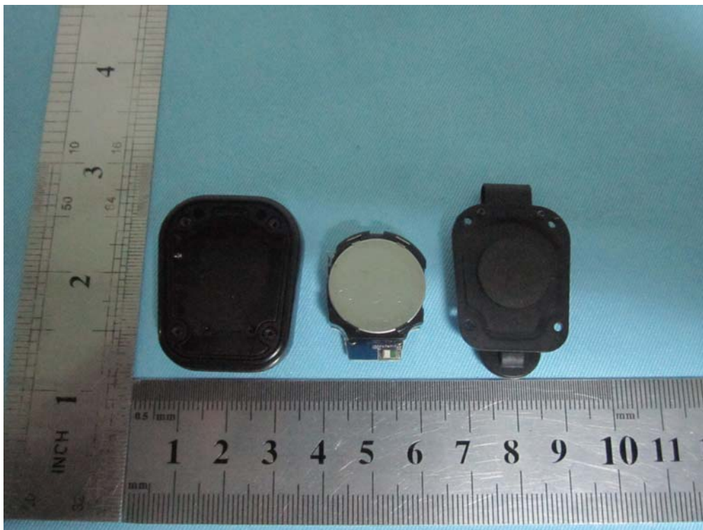
EUT - Cover Off View 2