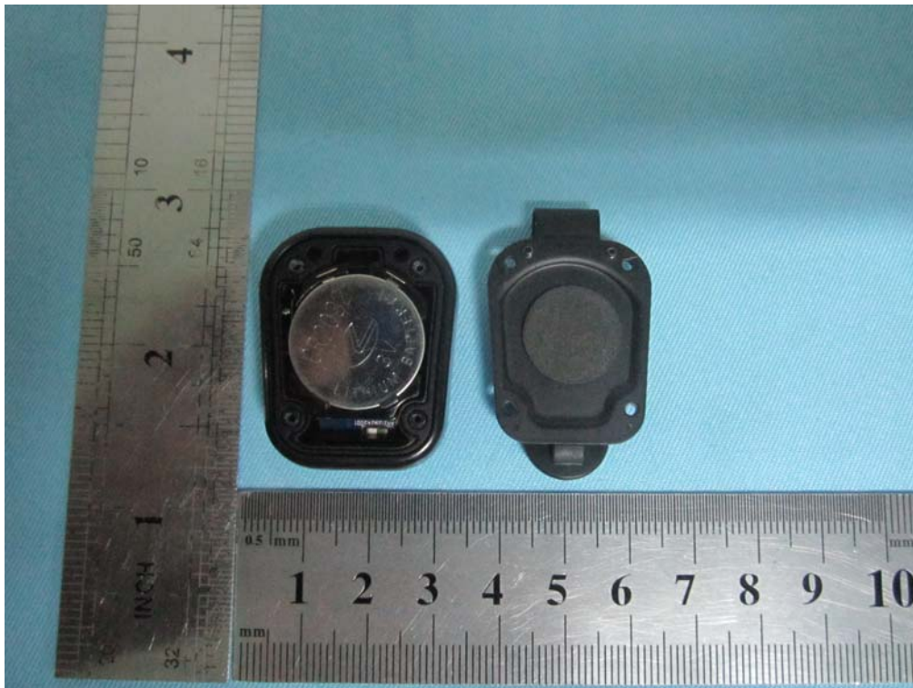
EUT - Cover Off View 1