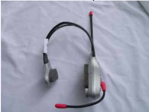
Front View of the product