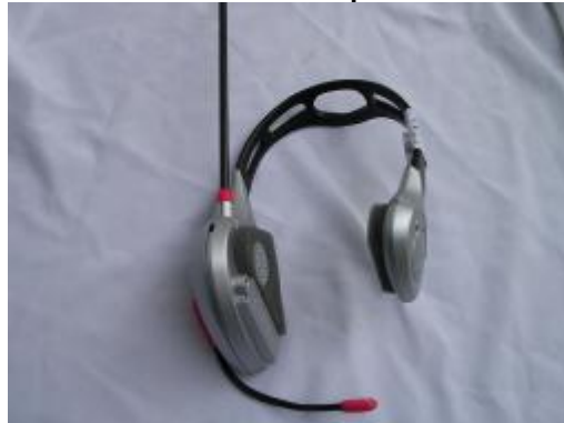
Rear View of the product