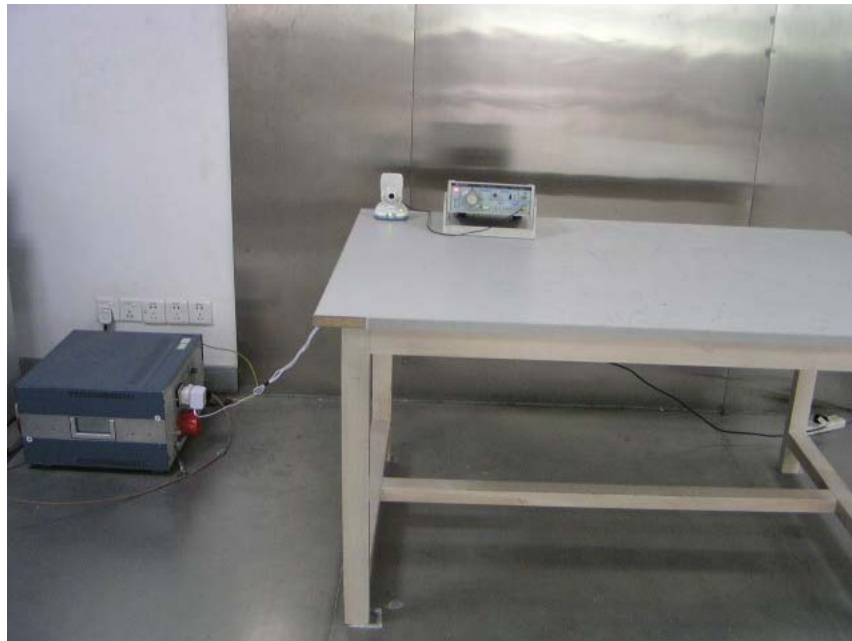
Conduction Emission - Rear View