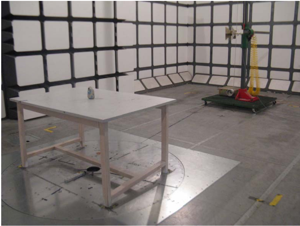
Radiated Emissions - Rear View (Above 1 GHz) Battery