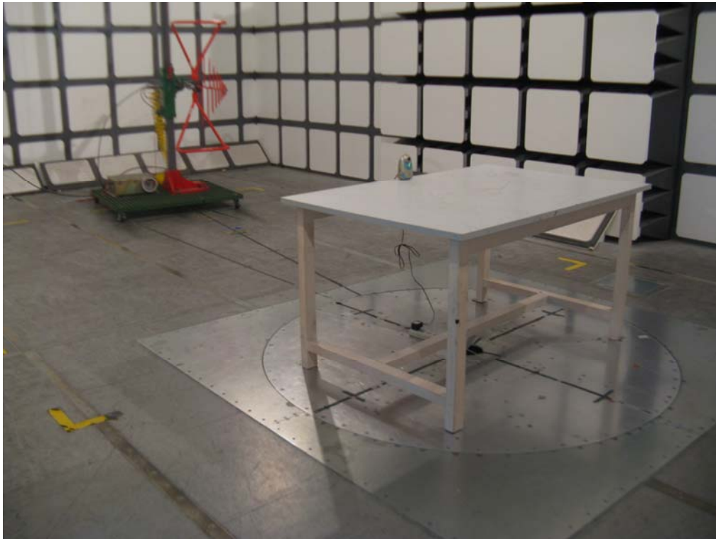
Radiated Emissions - Rear View (30 MHz-1 GHz) Adapter