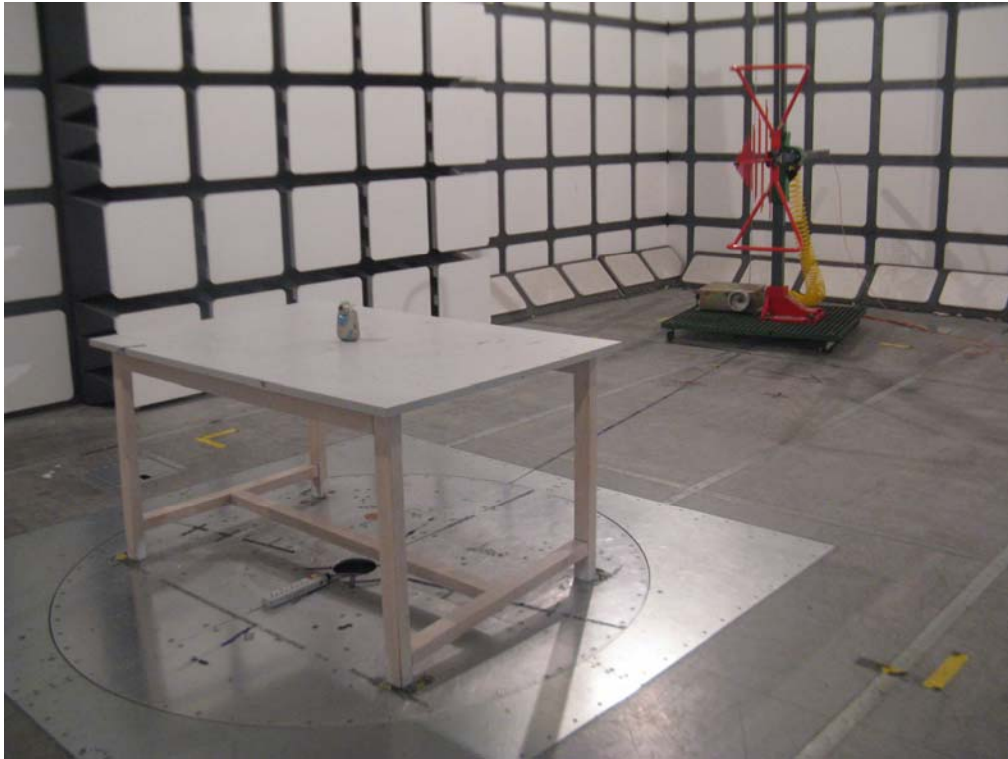
Radiated Emissions - Rear View (30 MHz-1 GHz) Battery