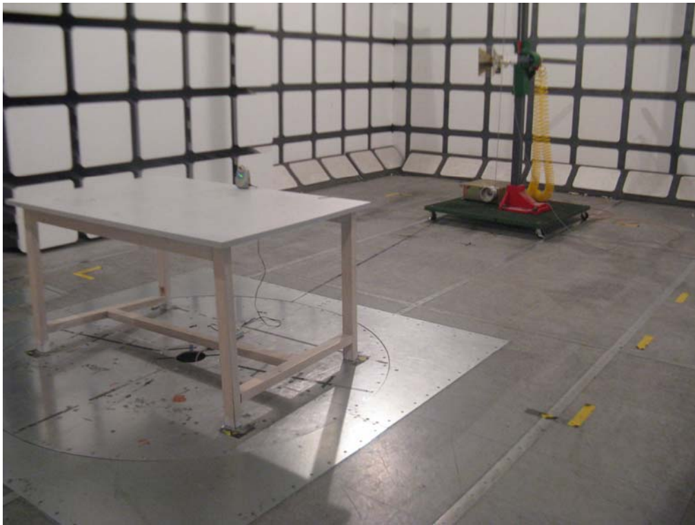
Radiated Emissions - Rear View (Above 1 GHz) Adapter