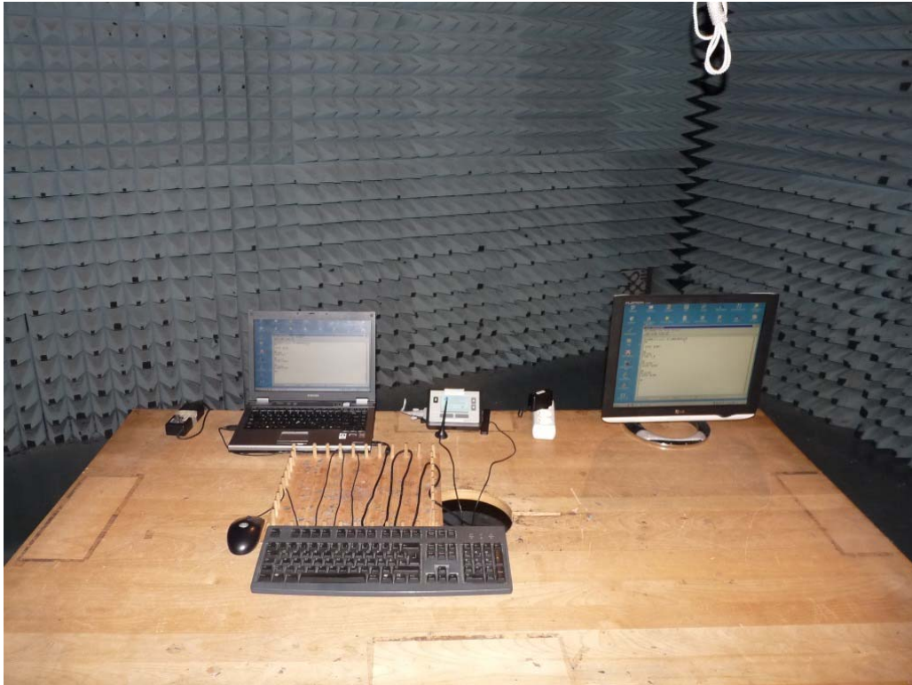
Photo 1: FCC 15b Test setup for radiated measurements (Enclosure, below 1 GHz). Powered by AC/DC converter and connected to laptop computer.