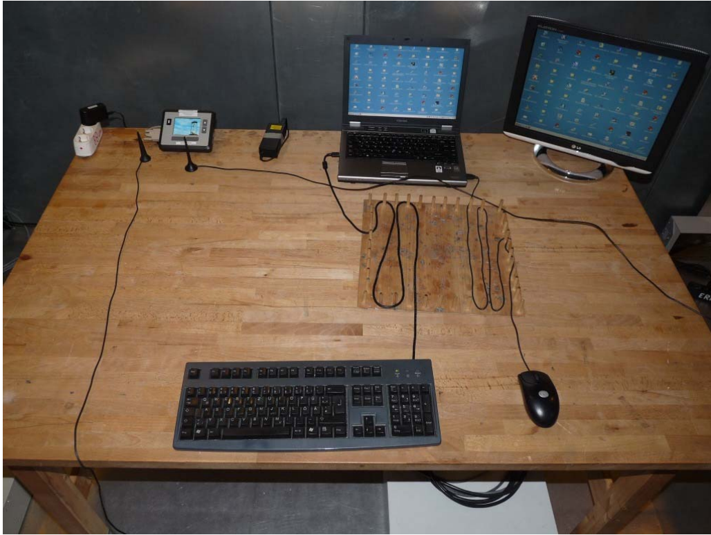
Photo 3: (FCC 15b) Test setup for conducted measurements (AC Port (power line)) EUT powered by: AC/DC converter and connected to laptop computer.