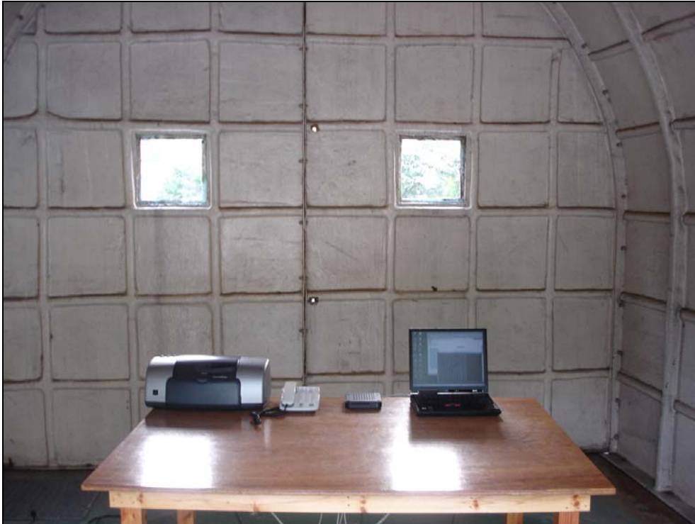
Photograph 2: Setup for Radiated Emissions