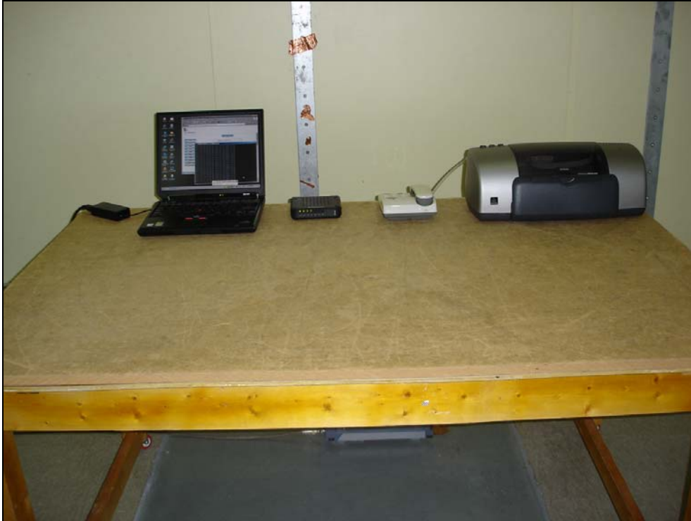
Photograph 1: Setup for Conducted Emissions