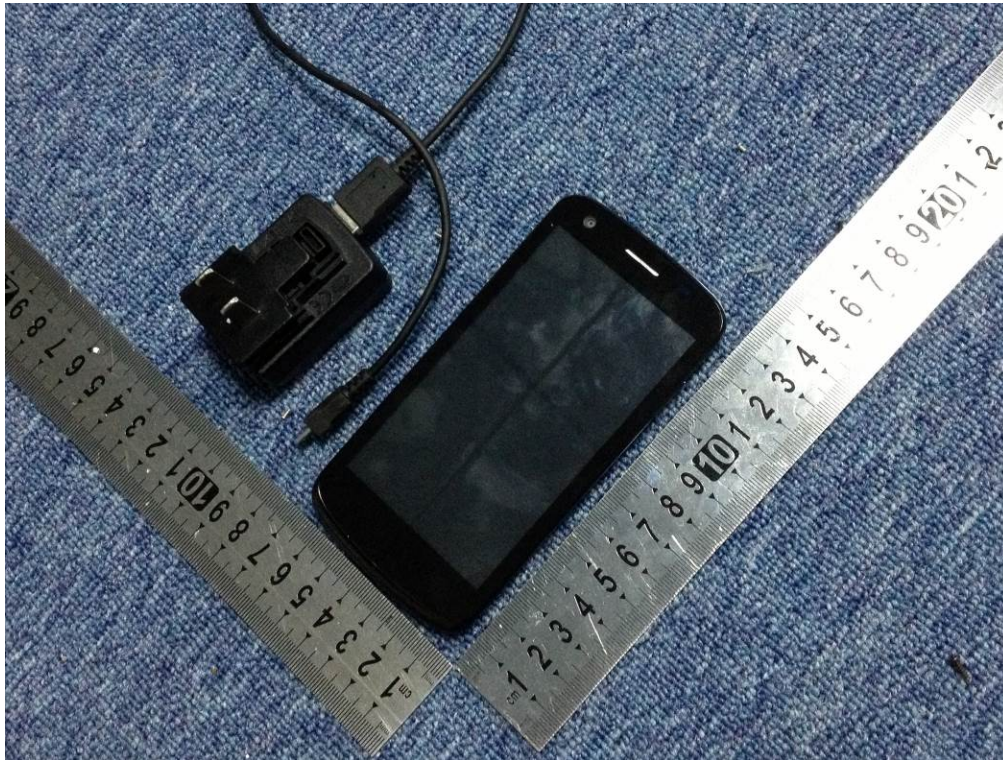
Appearance and size (obverse)