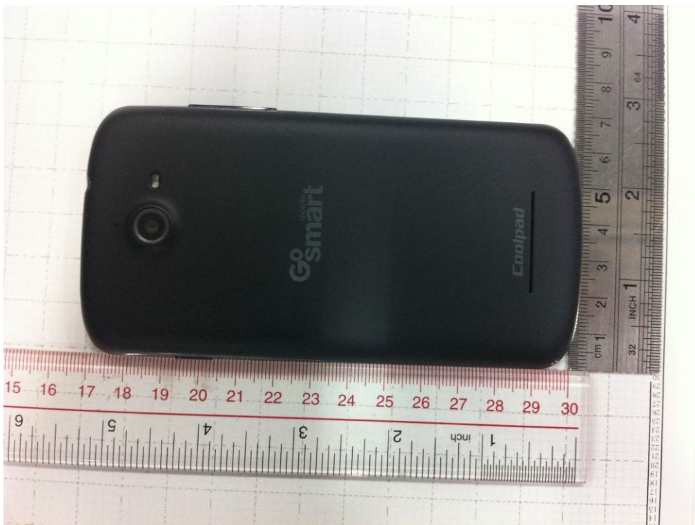
Appearance and size (reverse)