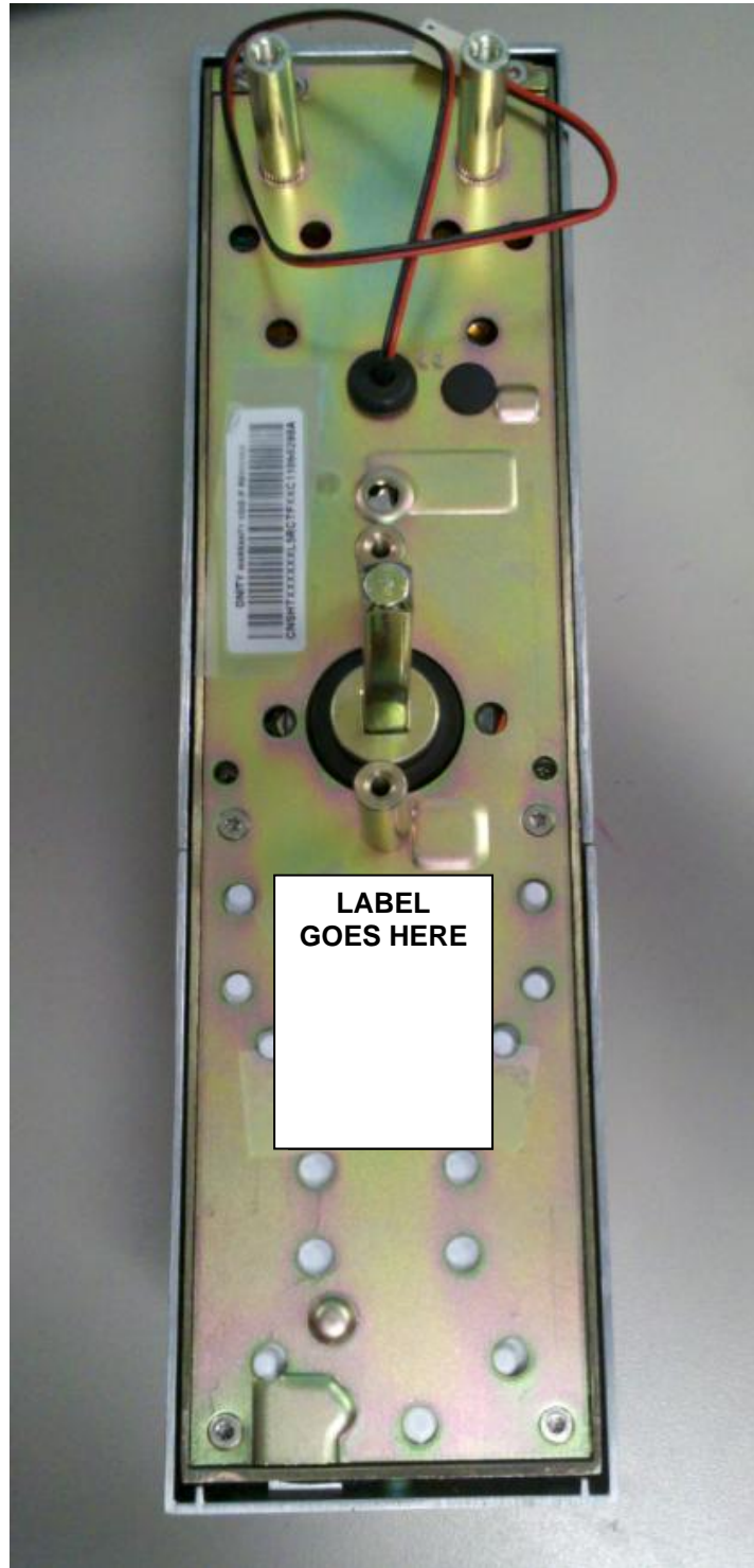
Figure 3. Label Location 2 on EUT (outside of the complete assembly) *Note: this label is visible to the purchaser of the equipment at the time of purchase.