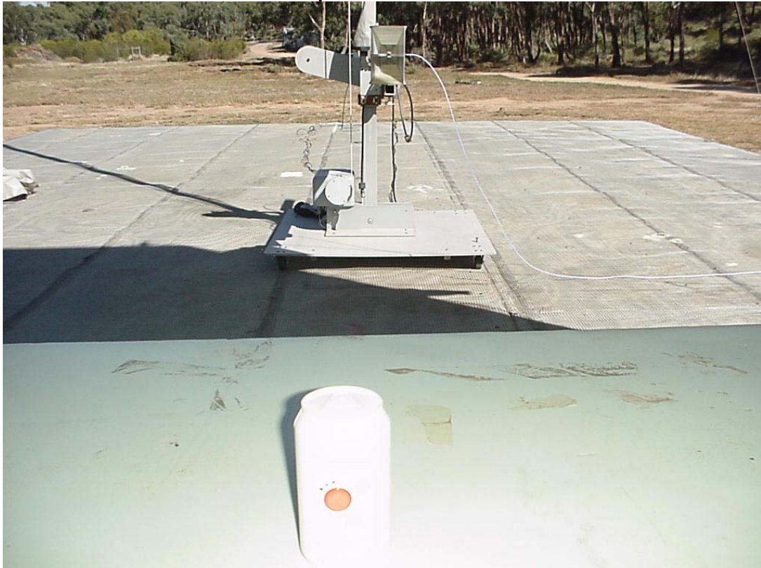
Radiated Measurements Test Setup